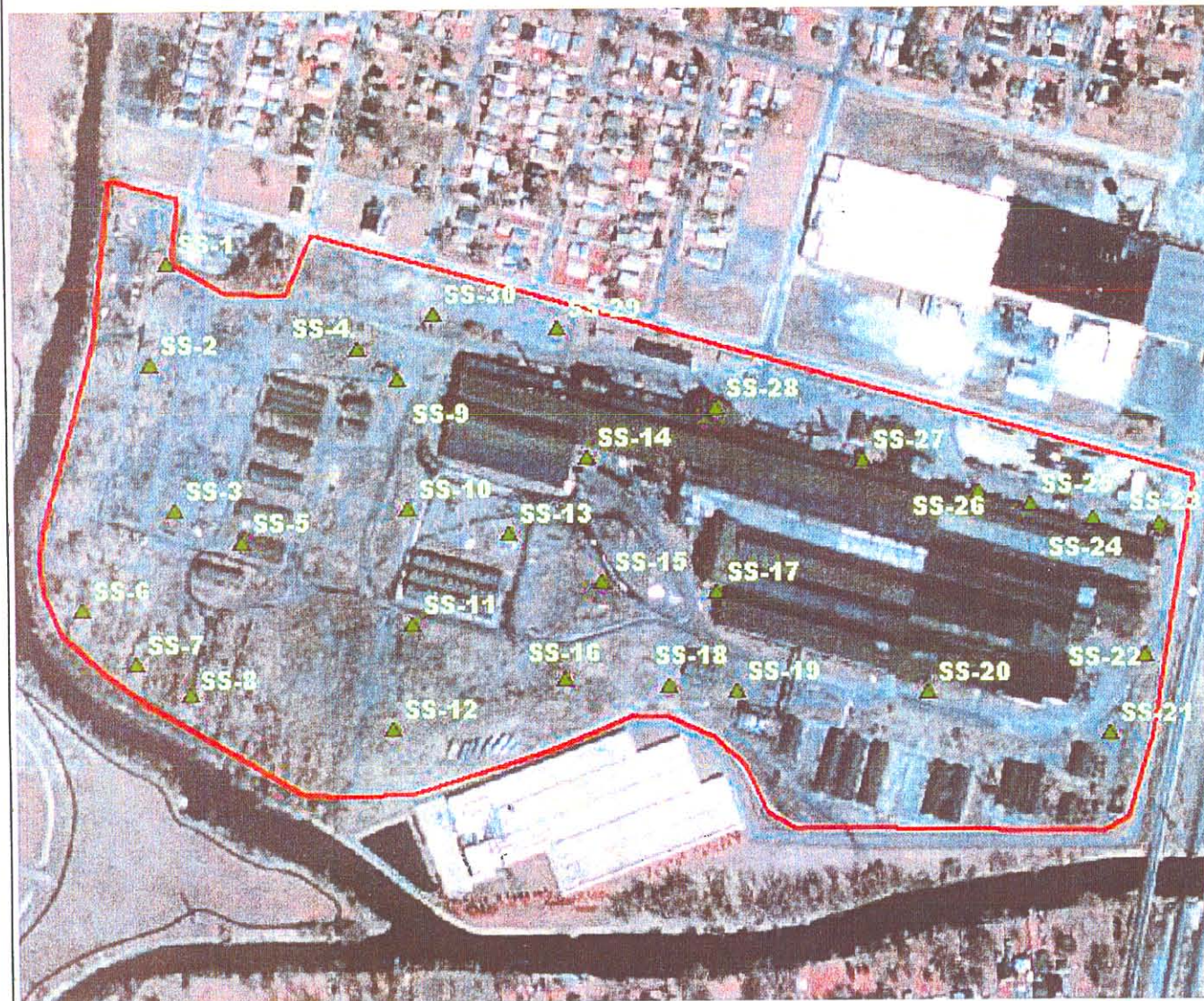
Figure 3 Surficial Soil Sample Locations

Mill Street Plant Site ID # MIB0000000107 205 Mill Street City of Ecorse Wayne County, MI Township 3 South Range 11 East Sections 16 and 17 Lat: 42 14 11 N* Lon: -83 09 21 W* *LAT/LON NAD-27