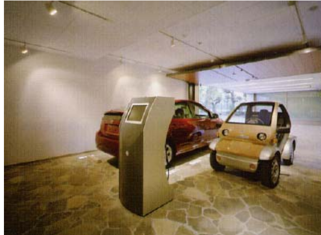
Plug-in vehicles to Toyota's Dream House.