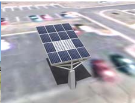
Concept drawing of "solar tree" plug-in car park