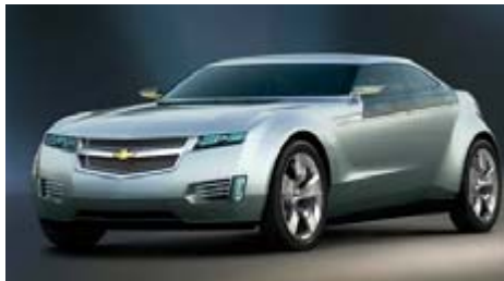
The 2007 Chevrolet Volt PHEV concept car