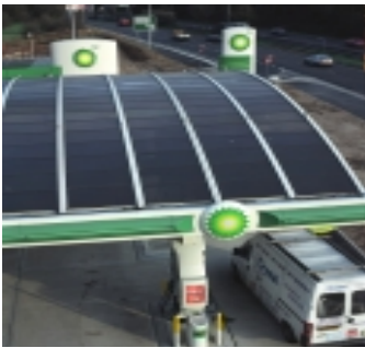
British Petroleum solar car park.

Connecting these advanced vehicles to a home in a Renewable Energy Community is important because PHEVs (or electric vehicles) could be connected to a utility grid in two directions — both distributing and accepting electricity. And the next-generation PHEV will have the ability to store excess electricity for timely return to the grid. We call this “two-way” plug-in a vehicle-to-grid (V2G). Utilities spend a tremendous amount for capacity to continuously balance supply and demand across the grid or provide