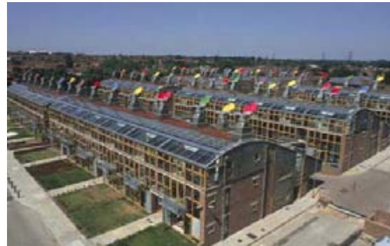
BedZED building in progress.