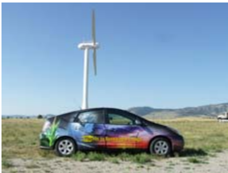
NREL's PHEV by wind turbine