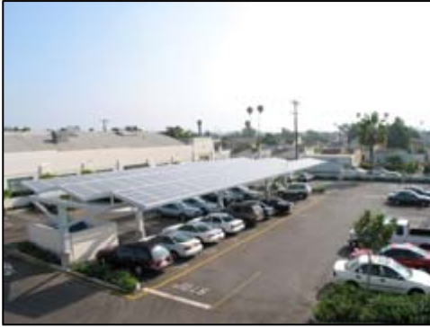
Solar car park.

Further building on elements one and two, element three includes adding a key technology element—advanced vehicles (electric, hybrid, plug-in hybrid, or alternative fueled) and/or energy efficient transportation (mass transit). The goal is to reduce energy use even further by not only powering homes from renewable energy, but powering cars from it as well.