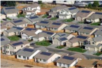
Zero-energy Homes Community Premier Gardens, Sacramento

Building on the sustainably planned communities in step one includes incorporating renewable energy technologies, such as solar/photovoltaics (PV) on rooftops, to become solar/zero-energy homes, or a community-based, renewable power generation system (micro-grids).