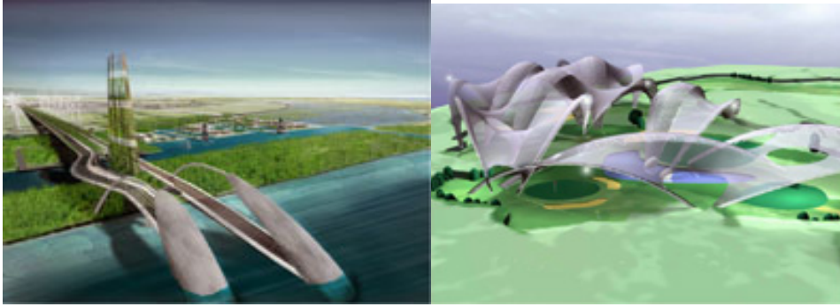
Conceptual drawings of Dongtan, China.