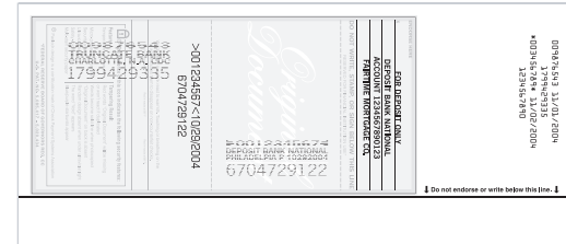
Back of a substitute check

Not all copies of a check are substitute checks. For example, pictures of multiple checks printed on a page (also known as an image statement) that is returned to you with your monthly statement are not substitute checks. Online check images and photocopies of original checks are not substitute checks either. You can use image statements and other copies of checks to verify that your bank has paid a check.