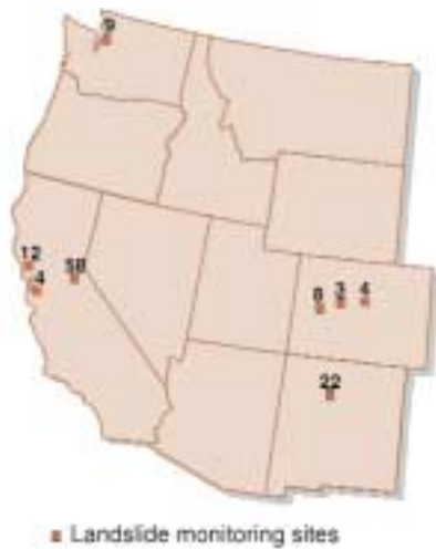
Current USGS remote landslide monitoring sites in the western United States (number indicates number of sensors in each area)

real-time systems can be crucial in saving human lives and protecting property. Traditional field observations, even if taken regularly, cannot detect changes at the moment they occur. Moreover, active landslides can be hazardous to work on, and large movements often occur during storms when visibility is poor. The continuous data provided by remote real-time monitoring permits a better understanding of dynamic landslide behavior that, in turn, enables engineers to create more effective designs to prevent or halt landslides.