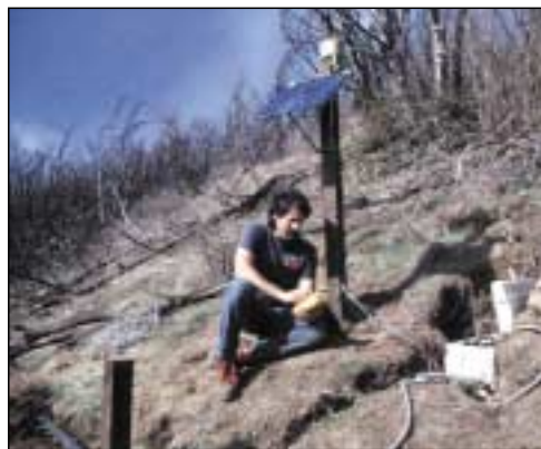
Above: Testing a solar-powered radio telemetry system for remote transmission of real-time landslide data