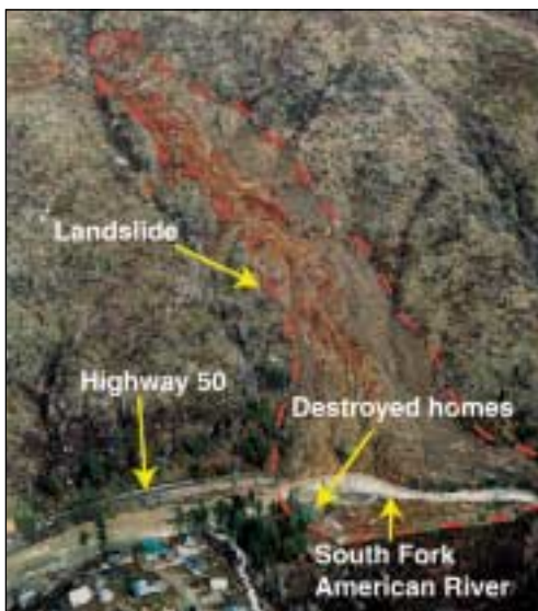
Massive landslide that blocked Highway 50 and temporarily dammed the South Fork of the American River

Why is it necessary to collect real-time landslide data remotely? The immediate detection of landslide activity provided by