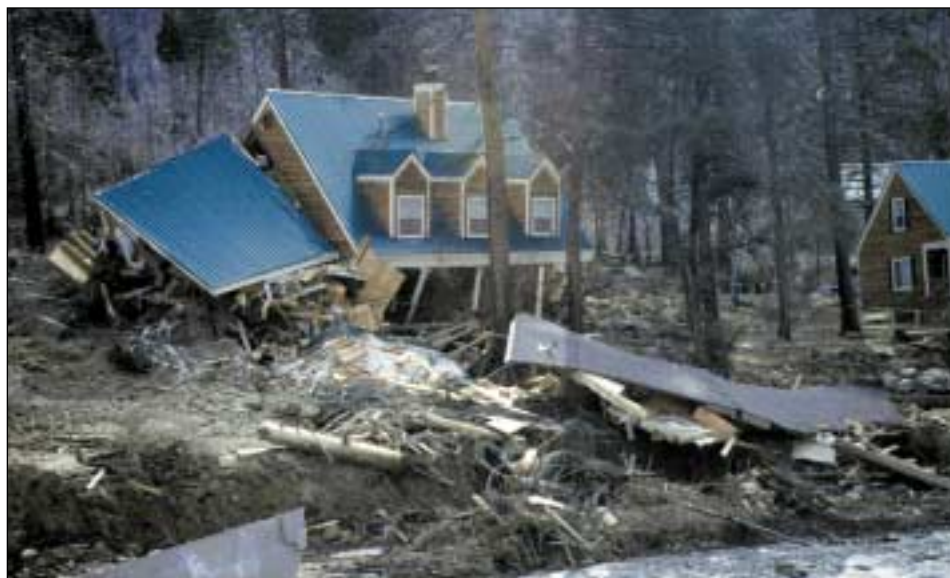
Homes destroyed by a sudden catastrophic landslide in 1997 along U.S. Highway 50, about 25 miles east of Placerville, California

L andslides threaten lives and property in every State in the Nation. To reduce the risk from active landslides, the U.S. Geological Survey (USGS) develops and uses real-time landslide monitoring systems. Monitoring can detect early indications of rapid, catastrophic movement. Up-to-the-minute or real-time monitoring provides immediate notification of landslide activity, potentially saving lives and property. Continuous information from real-time monitoring also provides a better understanding of landslide behavior, enabling engineers to create more effective designs for halting landslide movement.