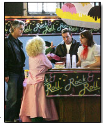
Ordering refreshments at the Sock Hop

The staff working the event and some of the people attending came dressed in swinging 50s attire. There were butcher paper and poster paint signs and also a large rack of 1950s-style garments, sunglasses, and wigs for those who did not come already dressed in 1950s attire to wear while having their photo taken. The photo booth was decorated with life-sized cutout figures of Marilyn Monroe, James Dean, and Elvis Presley.