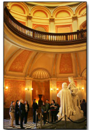
SDC staff touring the State Capitol

All in all, the tour was quite a learning experience and we hope to offer this opportunity to more employees in the future.