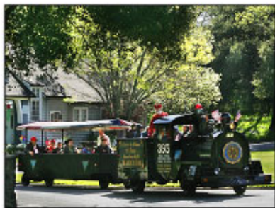
Voiture 395 from Solano County

These dedicated military men from Voiture #395 (Solano County) and Voiture #338 (Sonoma County) arrived at the pre-scheduled residential units and assisted the unit staff in getting as many clients who wanted to go for a ride into the colorful vehicles. They made their way up around the Eldridge Farm and back around the back soccer fields. They rode around the Butler Pool, the Farrell, Turner, and Van Horn buildings,