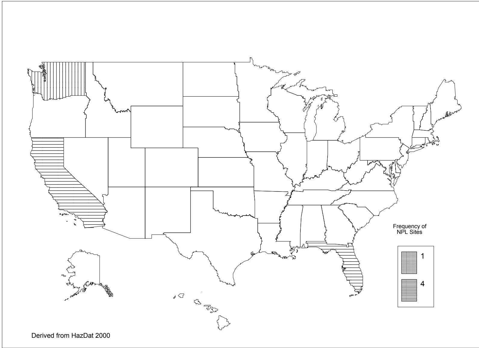
Figure 5-1. Frequency of NPL Sites with Ethion Contamination