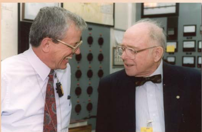
Mike and Nobel laureate Clifford Shull share a lighter moment during Shull's visit to the NCNR, 1995.