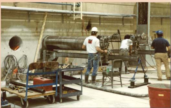
Drilling through 20' concrete wall to bring neutron guides from the source, 1989.