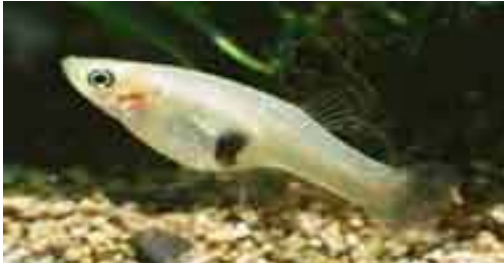
MOSQUITO FISH (GAMBUSIA AFFINIS)