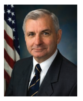
Jack Reed US Senator State of Rhode Island