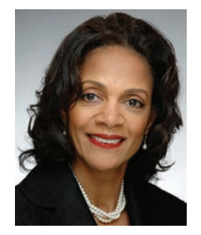
Sheila Dixon Mayor of Baltimore