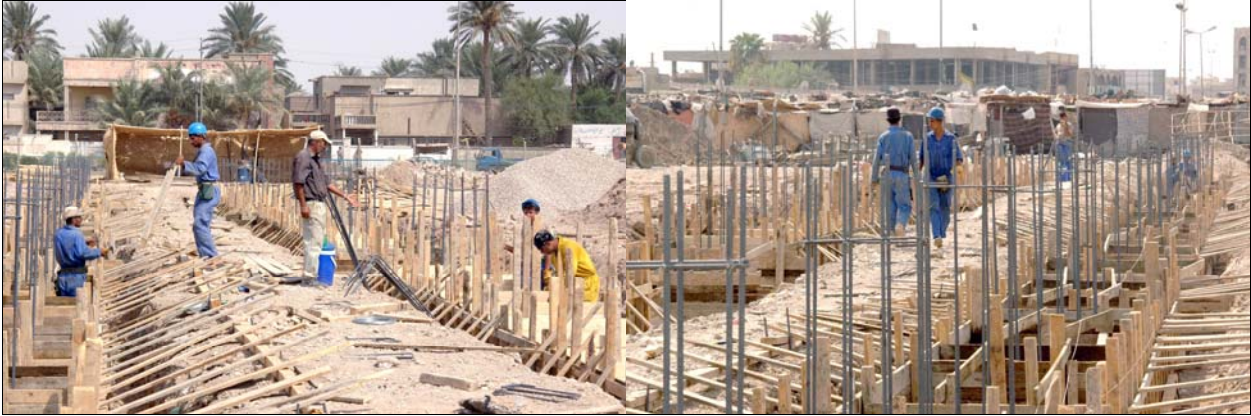
Construction is getting under way to build a $2.7 million fish market and a $2.4 million meat market in al Kut, Wasit Province.

Construction on both projects is scheduled to be completed next spring.