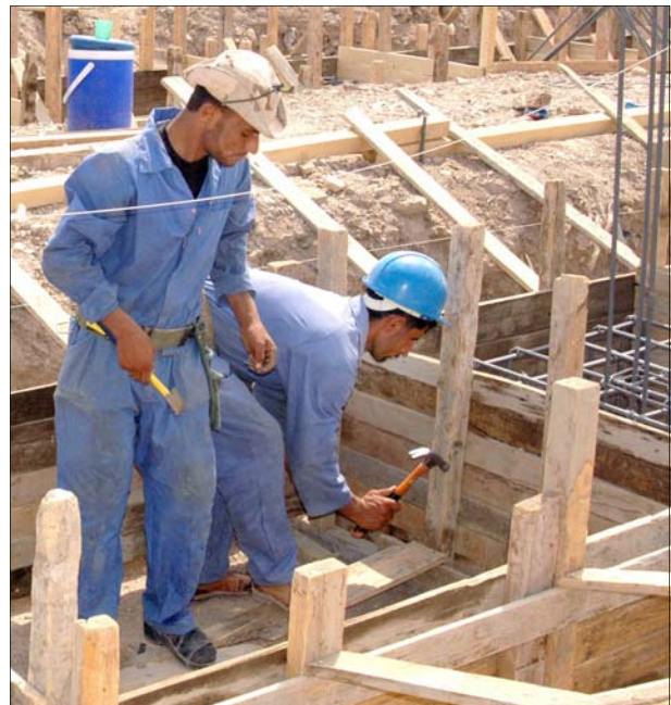
Iraqi workers help build a new fish market and a new meat market for al Kut, a city of 300,000 residents in Wasit Province..

More than 638 projects, including roads, schools, water treatment facilities and primary healthcare clinics, have been completed in Babil, Karbala, Wasit, al Qadisiyah, and an Najaf provinces over the past year, valued collectively at about $700 million.