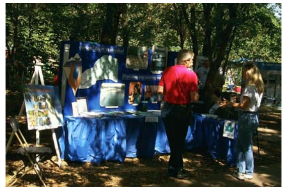
Displays at the Creek Week Celebration