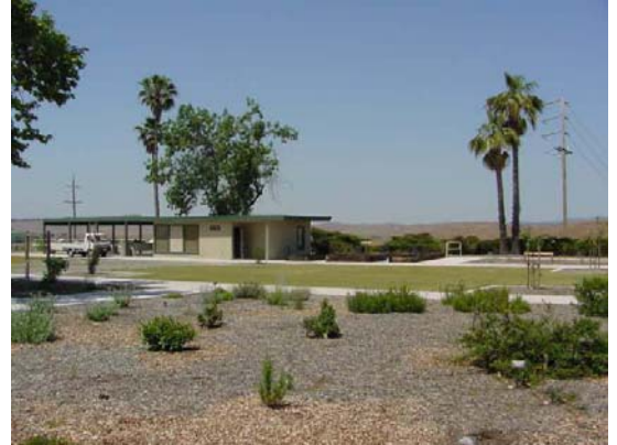
Future site of the Friant Water Education Center

Under construction for the past year, the Friant Water Education Center and Drought Tolerant Garden is set to open its doors officially this coming September. Constructed by the Center for Irrigation Technology at Fresno State in partnership with the U.S. Bureau of Reclamation, Millerton State Parks, and the California Division of Forestry, the garden has been designed as a self-guided tour for the public to view plants and landscaping options for this arid region of California. Tours have been conducted this spring by Parks and Recreation guides, which emphasize water conservation, water-wise uses, and plants having low water needs. The Center also features a small exhibit house where school children learn about water and the environment in the San Joaquin River watershed. Phase II and III of the Construction Program will encompass hands-on exhibits on irrigation systems, low-flow urban water uses, and general water conservation techniques. A firescape exhibit will also be included to assist foothill homeowners in selecting low water-use plants and effective landscaping for fire safe zones in communities.