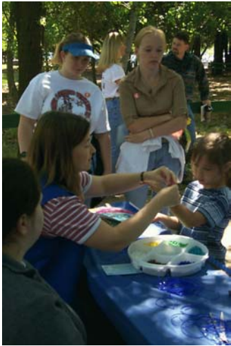
Children making water cycle bracelets

Volunteers and staff from the American River Water Education Center at Folsom Dam participated in the 12 th Annual Creek Week Clean Up Celebration. This event took place at Sacramento's Discovery Museum Science Center on Saturday, April 20, in celebration of this year's Earth Day. The festivities were hosted by the Sacramento Urban Creeks Council, which encouraged people from all walks of life to participate in river clean up and emphasized the importance of clean, usable water.