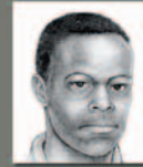
Age progression from 16 to 36 years from a poor quality photo

Images of unidentified victims suffering from extensive facial damage due to explosion, fire, exposure or mutilation, are painstakingly retouched to provide investigators with acceptable photos for identification.