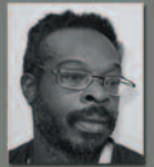
Arrest photo Age 36