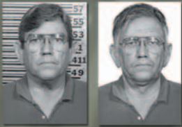
1989 Age 53