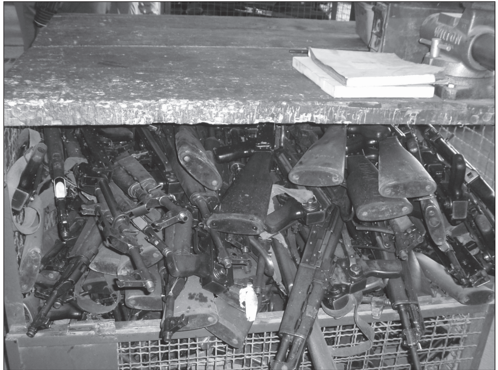
Figure 1: Donated Rifles of Variable Quality