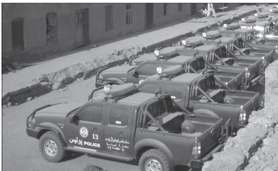
Figure 2: Trucks Awaiting Distribution to ANP

districts' property officers are first trained. For example, according to Defense, more than 1,500 trucks have been on hand and ready for issue since late 2007 (see fig. 2), but the Afghan Minister of Interior has delayed distribution of these vehicles until adequate accountability procedures are established in the target districts.