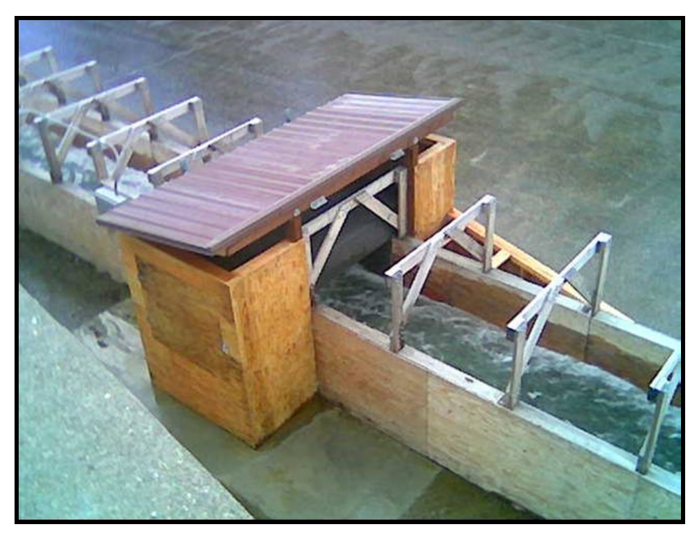
Photo 5. PIT tag antenna showing enclosure, sun shade, and spillways flow deflector