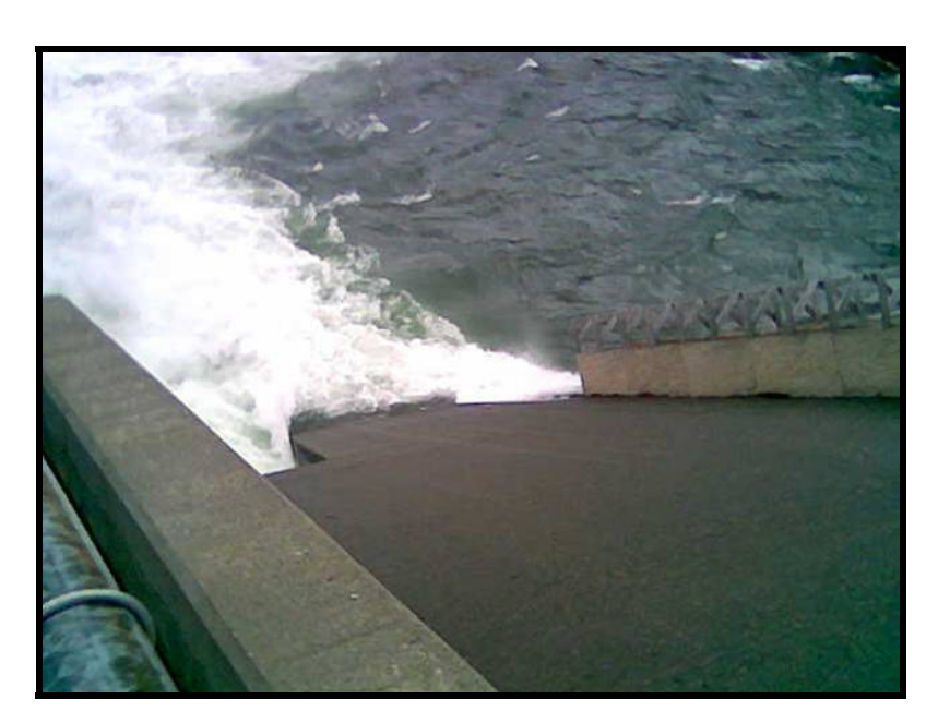
\label{prop:photo} \begin{tabular}{ll} Photo 6. & Fish passage flows and outlet works releases looking downstream \end{tabular}