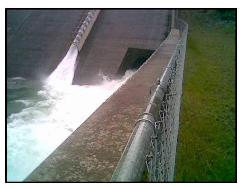
Photo 7. Fish passage flows and outlet works releases looking upstream