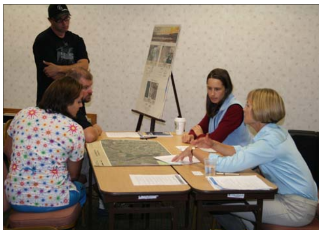
(Above) At the public open house in Chadron, Nebraska, Reclamation staff explain proposed alternatives to be included in the Resource Management Plan.

As a reminder the focus group consists of 14 primary members with multiple interests including a representative from SDGFP and Reclamation. The purpose of the group is to help identify issues raised by the public, assist with development of alternatives, and be a