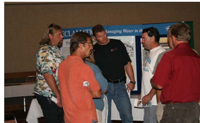
(Above) Public open house held in Rapid City, South Dakota, on July 28, 2008.

contact for the public. Additional individuals were brought in to assist the Focus Group in the decision making process for specific issues.