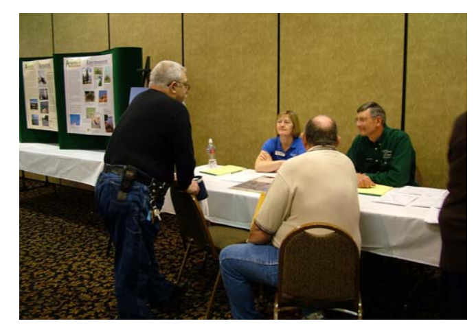
Public scoping meetings were held in three locations this past year. Visitors were able to view displays, gather information and talk to Reclamation and SDGFP staff about the reservoir and the RMP.

Willy Collignon – SDGFP 605-745-6996 13157 North Angostura Road Hot Springs SD 57747