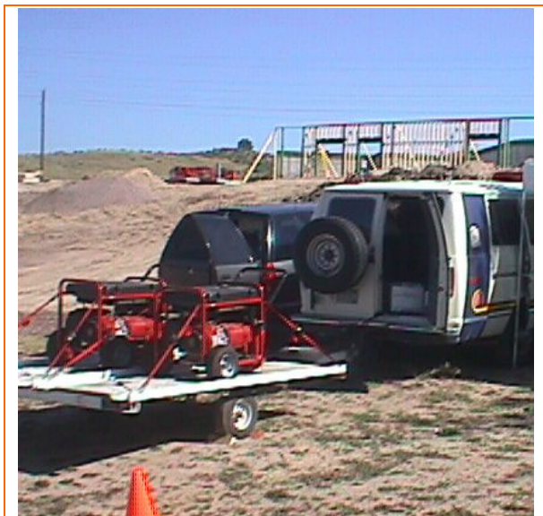
Figure 4-1 Two portable generators mounted on a trailer pulled by a van housing the TRP-1000 unit.

However, in situations where all of the radios are "keyed" for simultaneous transmission, the generator circuit breaker may be tripped.