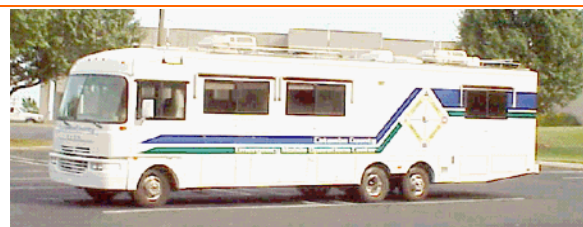
Figure 3-4 Example of a command post vehicle. A bigger vehicle allows more communications equipment to be carried to the scene alongside the TRP-1000.

The third common mobile deployment option involves placing the unit on a mobile command vehicle, typically a bus, motor home or large trailer as shown in Figure 3-4 . Although space may be a consideration when deciding to implement this option, the co-location of the TRP-1000 with the other incident command resources can prove invaluable when manpower is at a premium. Since many mobile command vehicles already include communications and dispatch capabilities along with the necessary technicians and operators to run them, the TRP-1000 could easily be connected to and managed by these existing resources.