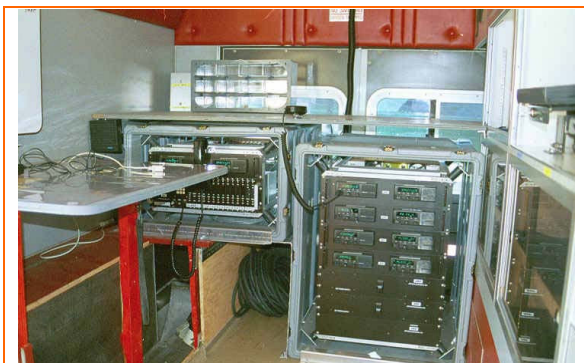
Figure 5-1 View of TRP-1000 mounted inside Chicago Fire Department's Field Communication Van.

The Field Communications vehicle is a refurbished 1992, Ford F350, with an ambulance body. The vehicle is equipped with a hydraulic extendible 50-foot tower that dramatically increases the range of the system. As shown in Figure 5-1 , the components are still housed in their shock resistant cases for increased protection and mobility. These units can still be removed from the ambulance and installed elsewhere relatively quickly.