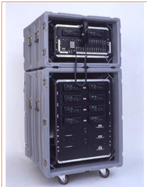
Figure 2-2 TRP-1000 – Includes the ACU-1000 Electronic Console in Shock resistant casing with pre-connected mobile radios and power supplies.