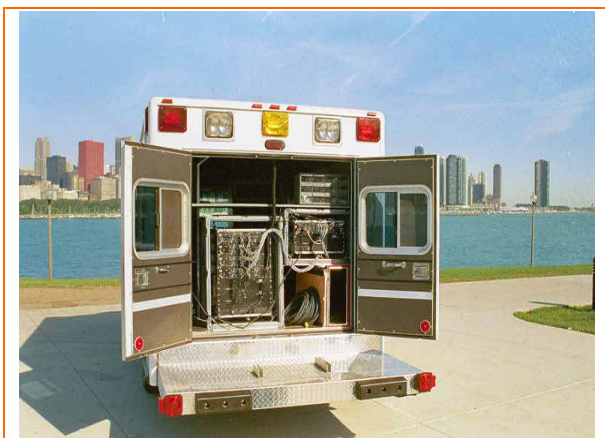
Figure 3-3 Example of a TRP-1000 unit mounted in the back of a converted ambulance. The inside has been reconfigured with counters and chairs for communications technicians.

Most of the vehicle configurations include strapping the TRP-1000 to the floor or side of the vehicle with a jump seat or bench for a technician to set-up and program the unit en-route. Some jurisdictions have designed the vehicle to supplement their command vehicle by moving their primary communications component from the command vehicle to the smaller TRP-1000 communications vehicle, and connecting the two via an intercom system.