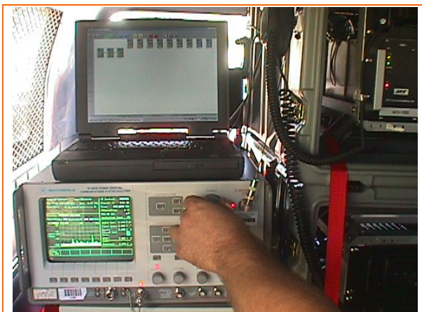
Figure 3-1 Laptop and radio frequency monitoring equipment connected to TRP-1000 system.

Based on ACU/TRP-1000 System demonstrations, the Office for Domestic Preparedness (ODP) funded a pilot program to place approximately 50 units in around 10 jurisdictions to determine the practicality of communications interoperability and the functionality of the ACU/TRP-1000 System.