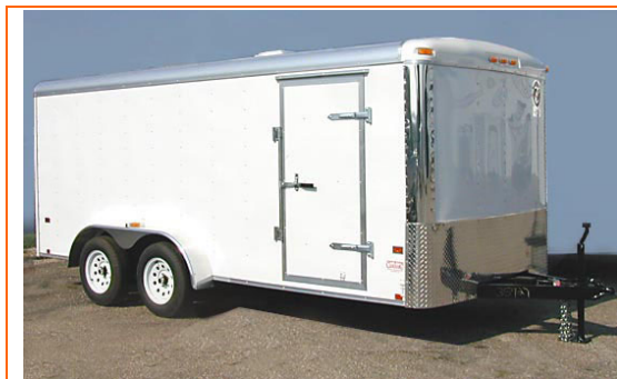
Figure 3-2 Example of enclosed trailer used to store and transport the TRP-1000.

and chairs in the trailer for extended operations.