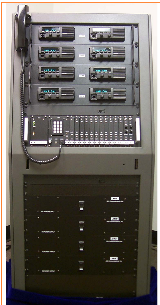
Figure 3-5 Example of fixed-site installation of TRP-1000 package.

Some jurisdictions have integrated the TRP-1000 into their fixed communications and dispatch facility as shown in Figure 3-5 . Others plan to use the unit as part of a backup emergency operations center. Since the TRP-1000 was designed as an interoperability solution, it does allow for the establishment of talk groups and patches between frequencies.