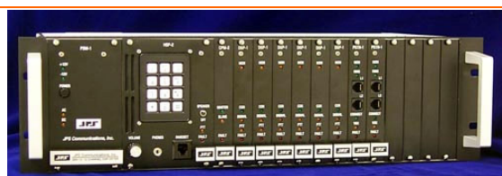
Figure 2-1 ACU-1000 Electronic Console – radio systems patch into this panel, which can be connected to a computer.

This handbook discusses both the fixed base and mobile interoperable communications systems. The ACU-1000 Modular Interconnect System (as shown in Figure 2-1 ) is designed for fixed base operations. This system, manufactured by JPS Communications, Inc., contains the Gateway Switch, and is capable of interconnecting diverse radio, telephone, and cellular units to allow multi-agency communication. This system has the added benefit of adding a backup capability to regular communication and dispatch systems.