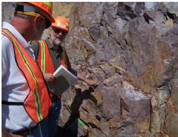
FERC Staff inspect Taum Sauk Project.