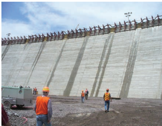
Inspection of Taum Sauk Project.