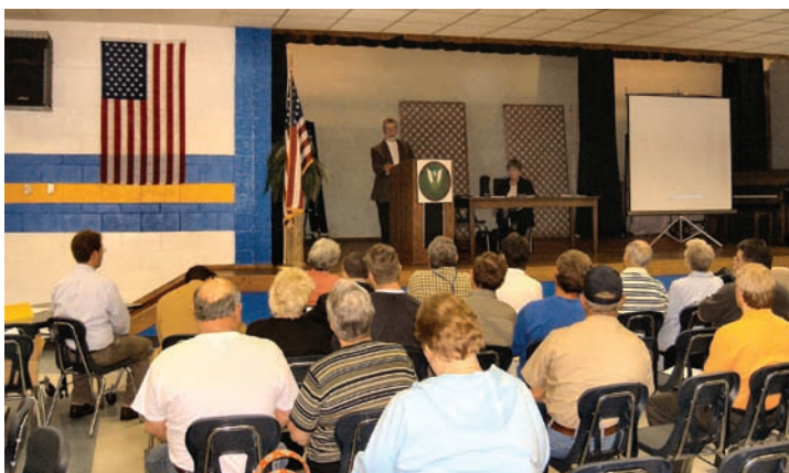
FERC scoping meetings.