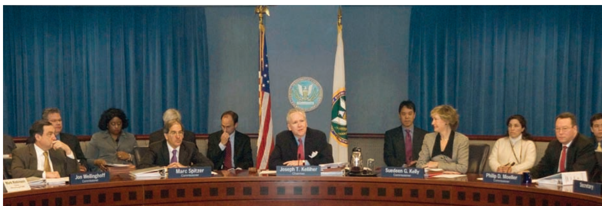
Commission Open Meeting.