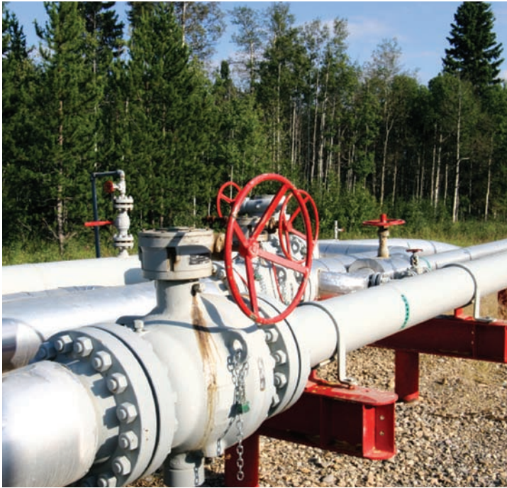
Natural gas pipeline.