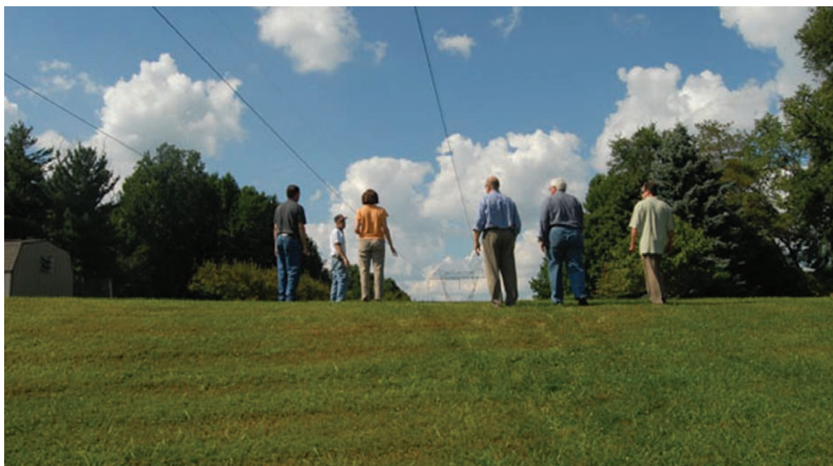
FERC scoping meeting.

For long transmission projects, such hearings will occur at a number of sites along the proposed routes. Hearings are held during the day, in the evening, and on weekends. These hearings play an important role in Commission decisions. Frequently, public concerns raised in these hearings result in changes reflected in FERC's final orders. These hearings give the public a convenient