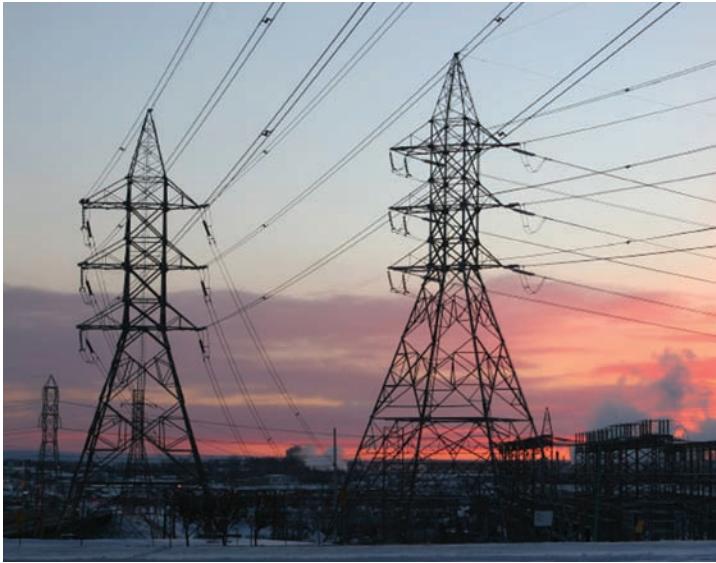
Electric Wholesale Transmission.