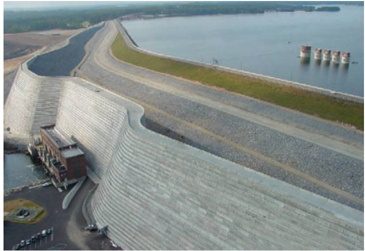
Saluda Dam reconstruction.