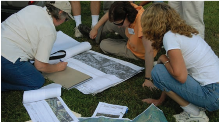
FERC Staff Meeting with public.

opportunity to provide information or comments that will be included in the formal record for the proceeding.