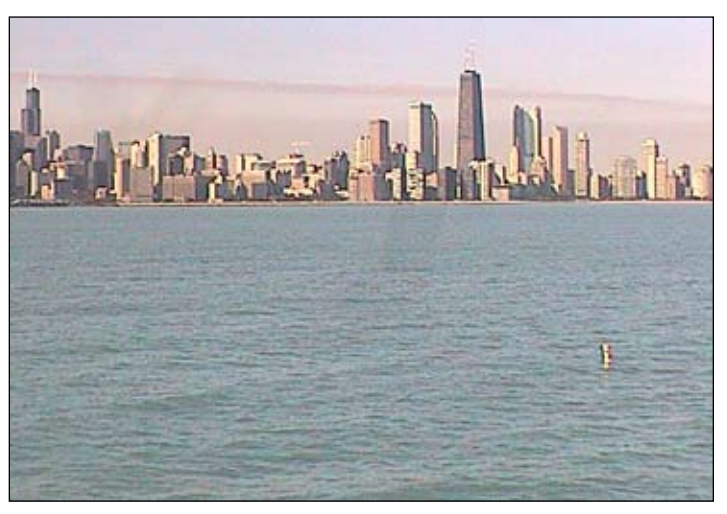
WebCam photograph of the Chicago skyline from the Chicago Met Station.

The Met Stations provide vital weather data that scientists incorporate within complex computer models used to produce nowcasts and forecasts of waves and circulation available on the Great Lakes Coastal Forecasting System (http://superior.eng.ohio-state.edu/). Observations from these stations are also provided to the National Weather Service (NWS) marine forecast offices at Milwaukee, Chicago, and Grand Rapids in real-time. Fishers, boaters, surfers, and other recreational users have found the real-time conditions and WebCam images particularly useful in making plans for when and where to venture out on the waters.