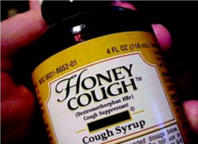
Figure 3. Cough syrup with DXM.

Pure powdered DXM—typically intended for sale to laboratories conducting research on the drug—is available from some Internet web sites. DXM purchased from such sites contains no other ingredients, which substantially increases the risk of overdose. Two powdered DXM-related deaths occurred in Illinois—one in September 2003 and the other in February 2004. One incident was ruled a suicide; the other was an accidental overdose.