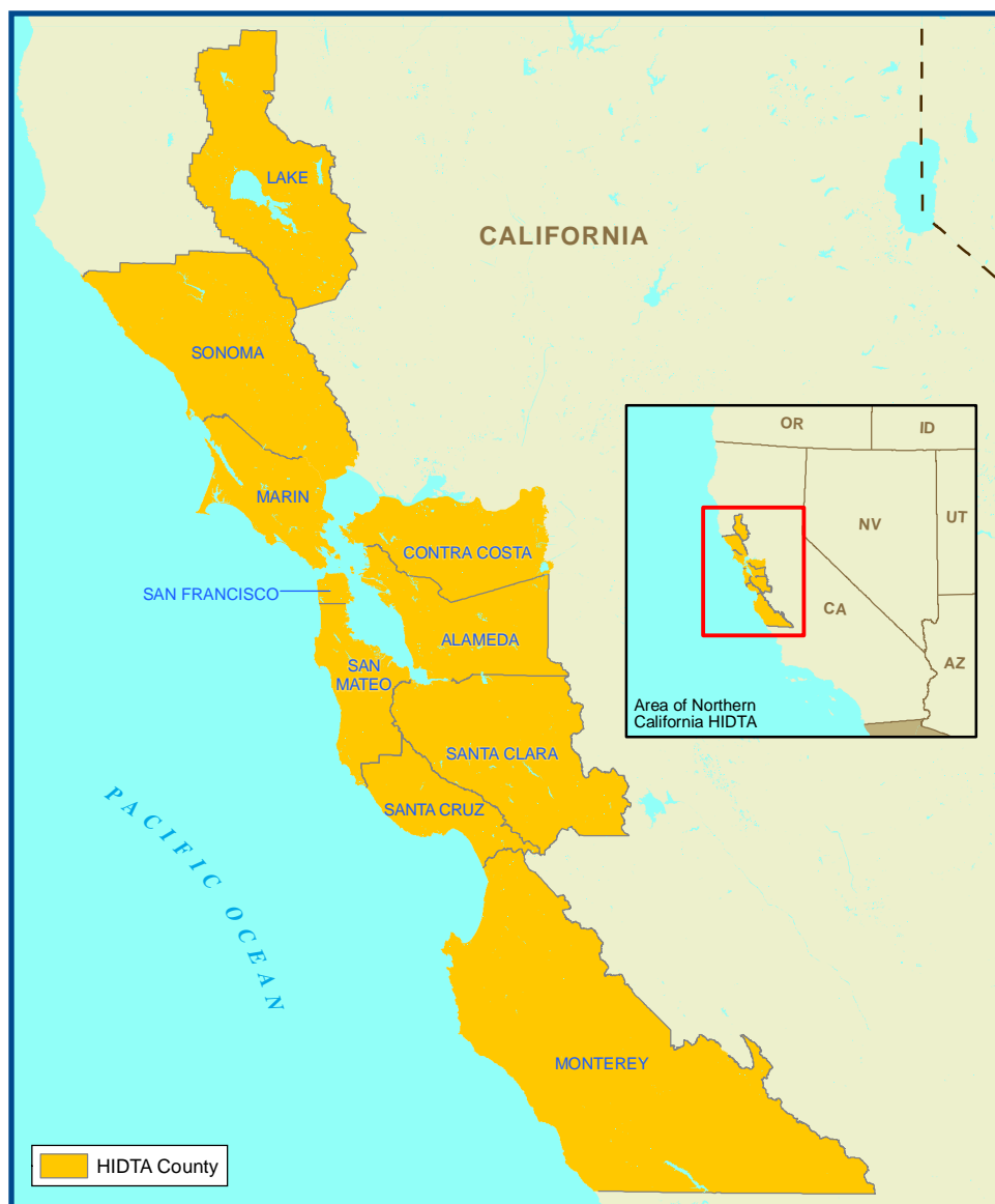
Figure 1. Northern California High Intensity Drug Trafficking Area.

This assessment provides a strategic overview of the illicit drug situation in the Northern California High Intensity Drug Trafficking Area (HIDTA), highlighting significant trends and law enforcement concerns related to the trafficking and abuse of illicit drugs. The report was prepared through detailed analysis of recent law enforcement reporting, information obtained through interviews with law enforcement and public health officials, and available statistical data. The report is designed to provide policymakers, resource planners, and law enforcement officials with a focused discussion of key drug issues and developments facing the Northern California HIDTA.