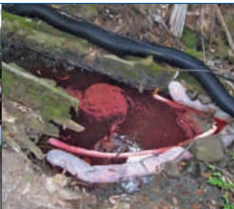
Figure 4. Barriers used to contain a red diesel fuel spill from an outdoor generator into a natural waterway.