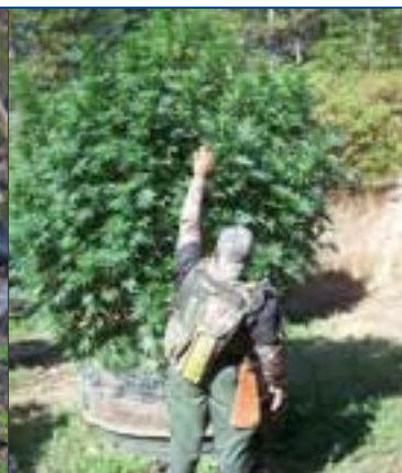
Figure 5. Large cannabis plants seized from an outdoor grow site.