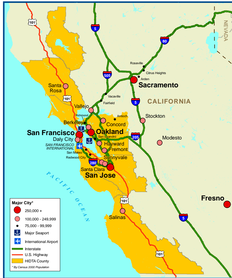
Figure 6. Northern California transportation network.

highway system enables traffickers to modify transportation routes, adapt to changes in source areas, and counteract law enforcement interdiction operations with limited interruption to supply.