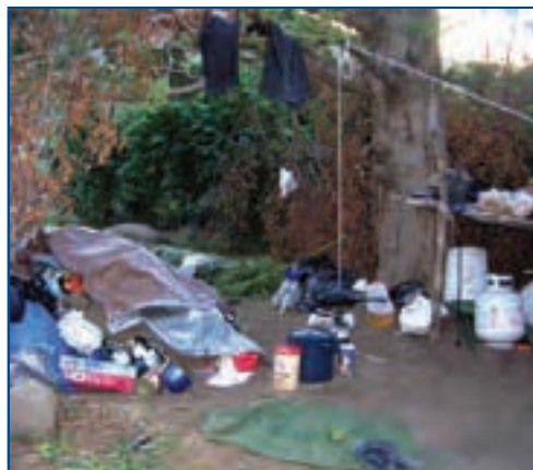
Figure 3. Outdoor marijuana grow encampment.