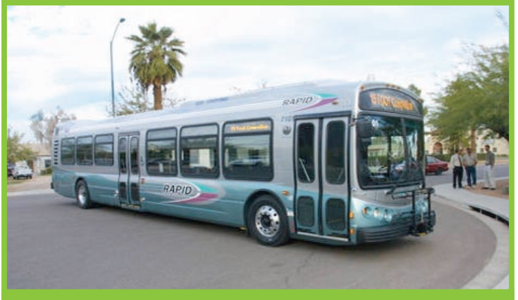
Figure 1. Liquefied Natural Gas Bus Operated by Arizona's Valley Metro

Natural gas is a domestically available resource. The U.S. Department of Energy (DOE) supports natural gas vehicle and infrastructure research, development, and deployment through its FreedomCAR and Vehicle Technologies Program to help the United States reduce its dependence on imported petro-leum and to pave the way to a future transportation network based on hydrogen. Natural gas vehicles can also reduce emissions of regulated pollutants compared with vehicles powered by conventional fuels such as gasoline and diesel. The goal of the Natural Gas Transit Users Group (TUG) is to facilitate the deployment of natural gas vehicle and infrastructure technology in transit fleets.