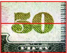
Copper to green color-shifting ink