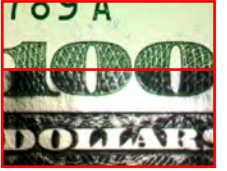
Green to black color-shifting ink