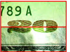
Copper to green color-shifting ink