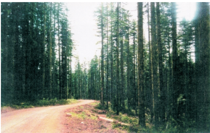
The Eagle Timber Sale showing the area recently harvested (to the right of the road) compared to the areas not harvested.

... An excellent example of Ecosystem Management