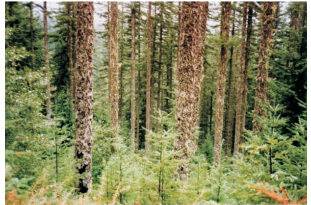
Here is a nearby area 10 years after being harvested. The Eagle project area should look like this after harvest: an increase in structural diversity good for wildlife.