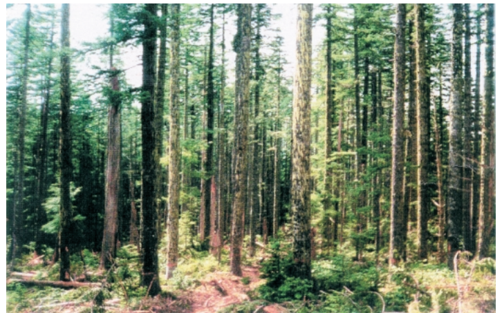
The Forest looks like a forest after timber harvest.