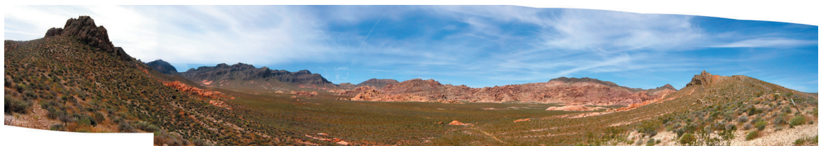
Figure 1. Panoramic photograph of Hidden Valley, showing floor of Aztec Sandstone (pink) and surrounding hills of Paleozoic carbonate rocks (dark grey).

The Hidden Valley ACEC was visited briefly to confirm descriptions of the geology that were gleaned from the scientific literature. Definitions of mineral resource potential and certainty levels are given in appendix 1, and are similar to those outlined by Goudarzi (1984).