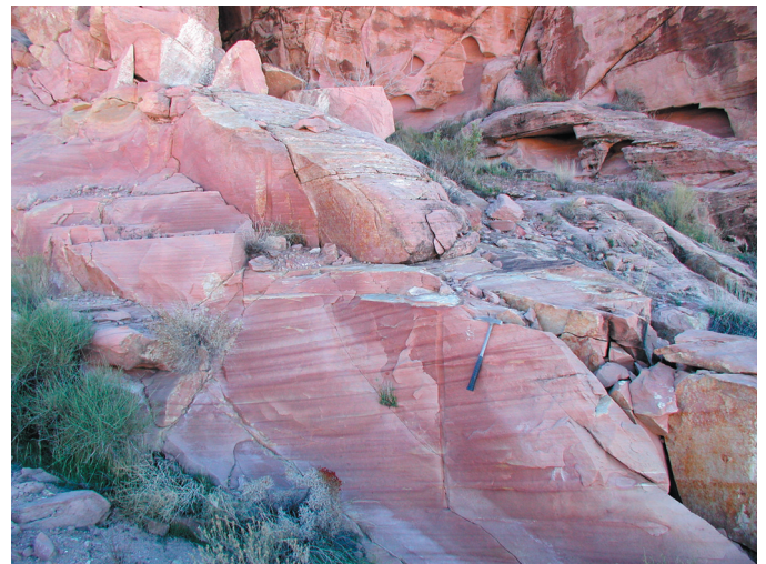
Figure 4. Aztec Sandstone at a small quarry near the Hidden Valley ACEC. Note the drill hole to the left of the rock hammer.