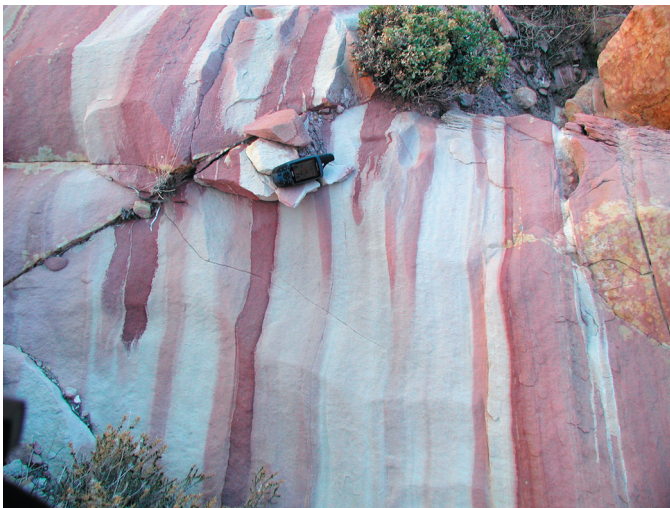
Figure 3. Banded pale-red and white Aztec Sandstone from a quarry near the northern boundary of the Hidden Valley ACEC. GPS instrument (15 cm long) for scale.

There has been no known modern mineral exploration or development in this ACEC. Past development activity was restricted to limited quarrying of building stone at two sites