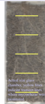
Actual size glass chamber, yellow lines indicate transect lines where mycorrhizae were monitored.

All endpoints were analyzed using ANOVA with activated carbon, inocula, and removal method as factors.