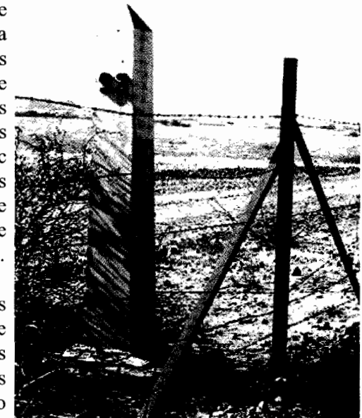
Boundary Demarcation Monument

The USIBWC maintains a second Arizona office in Yuma, which works primarily on issues related to the Colorado River.