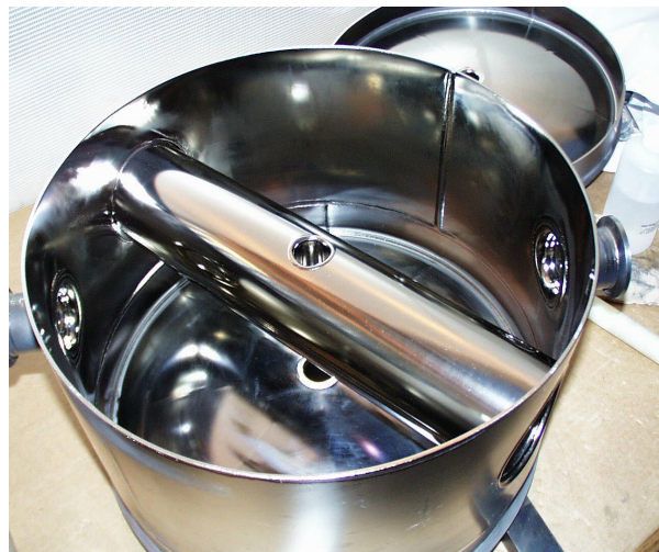
Figure 1: Prototype niobium spoke cavity for \beta = 0.4 prior to welding on the end bulkhead. The outer diameter of the 350 MHz cavity is 44 cm.

Principal parameters for the two prototype cavities are shown in Table 1. To minimise time and cost, the two prototype cavities were designed to require no sheet-metal forming dies. Also, cavities were formed for two different velocities by changing only the cavity length and spoke diameter. For use in a linac, the frequencies of