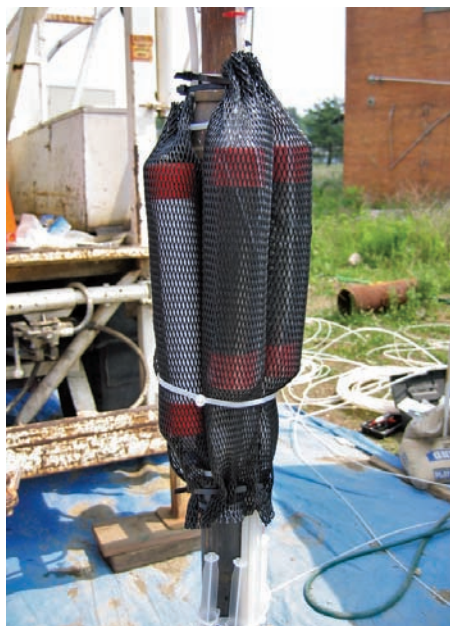
Low-cost diffusion samplers are placed in wells at the NAWC to monitor contaminant concentrations and geochemistry.

In 2001, The USGS began the multidisciplinary, cooperative research effort that currently also involves scientists from the Navy, New Jersey Department of Environmental Protection and New Jersey Geological Survey, and universities and other research institutions. A 2005 biostimulation and bioaugmentation study was conducted with private sector researchers—Geosyntec Consultants and ECOR Solutions—on behalf of the Navy. Research support is provided by the USGS, the Navy, the U.S. Environmental Protection Agency (EPA), and the U.S. Department of Defense Strategic Environmental Research and Development Program (SERDP), operated in partnership with EPA and the U.S. Department of Energy.