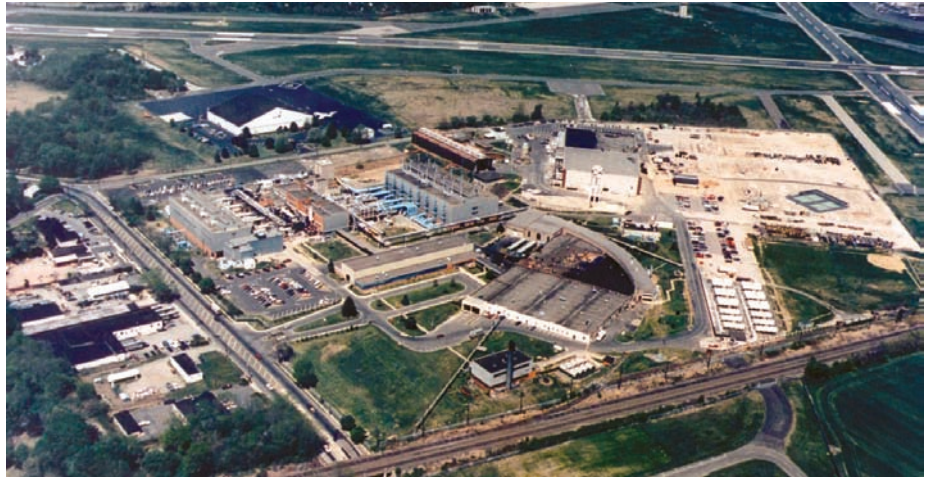
The U.S. Navy tested jet engines at the Naval Air Warfare Center, West Trenton, New Jersey, from the mid-1950s until the late 1990s. Fractured bedrock at the site was contaminated with trichloroethylene (TCE) used during the testing operations.

The U.S. Geological Survey and cooperators are studying chlorinated solvents in a fractured sedimentary rock aquifer underlying the former Naval Air Warfare Center (NAWC), West Trenton, New Jersey. Fractured-rock aquifers are common in many parts of the United States and are highly susceptible to contamination, particularly at industrial sites. Compared to “unconsolidated” aquifers, there can be much more uncertainty about the direction and rate of contaminant migration and about the processes and factors that control chemical and microbial transformations of contaminants. Research at the NAWC is improving understanding of the transport and fate of chlorinated solvents in fractured-rock aquifers and will compare the effectiveness of different strategies for contaminant remediation.