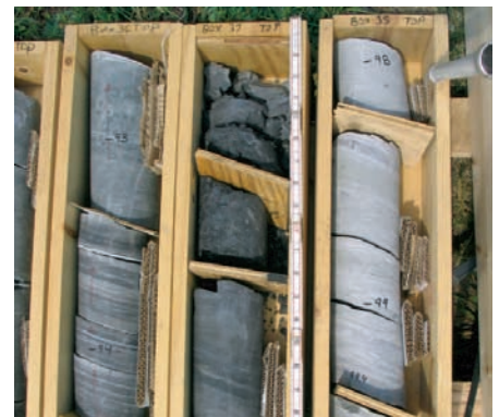
Rock cores from a borehole at the NAWC, showing the dipping mudstone strata that are pathways for ground-water flow and chemical transport.

In 1993, the USGS began studies at the NAWC in cooperation with the U.S. Navy.