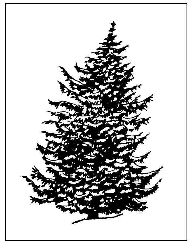
Figure 1. Middle-aged Canadian Hemlock.

Scientific name: Tsuga canadensis Pronunciation: TSOO-guh kan-uh-DEN-sis Common name(s): Canadian Hemlock, Eastern Hemlock Family: Pinaceae USDA hardiness zones: 4 through 7A (Fig. 2) Origin: native to North America Uses: Bonsai; hedge; screen; shade tree; specimen; no proven urban tolerance Availability: generally available in many areas within its hardiness range