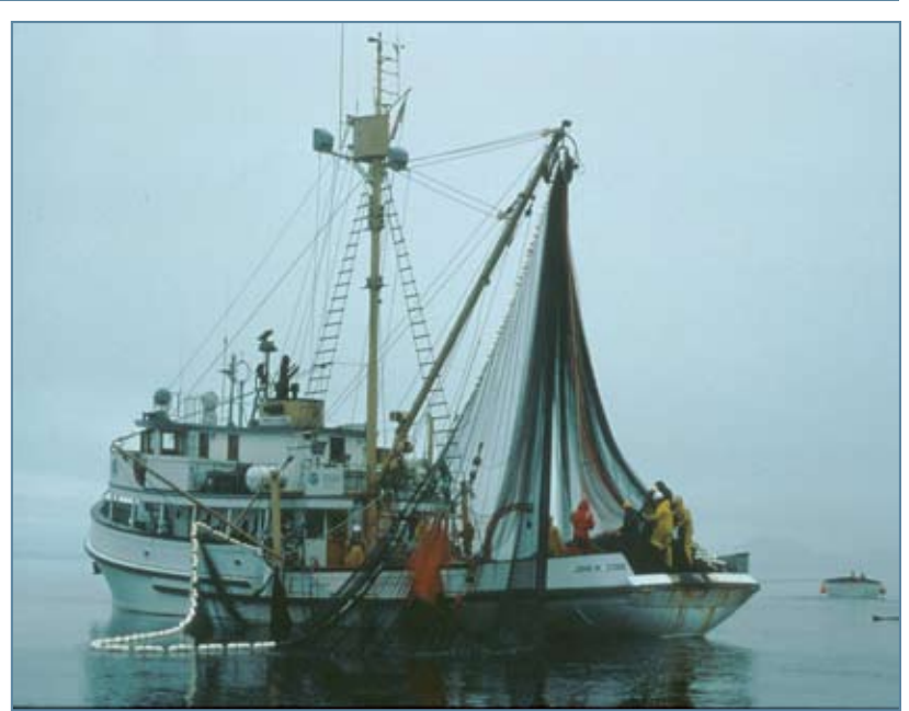
The Cobb in 1984 purse seining for juvenile salmon in Lower Chatham Strait.

http://www.fish.washington.edu/history/1919.html