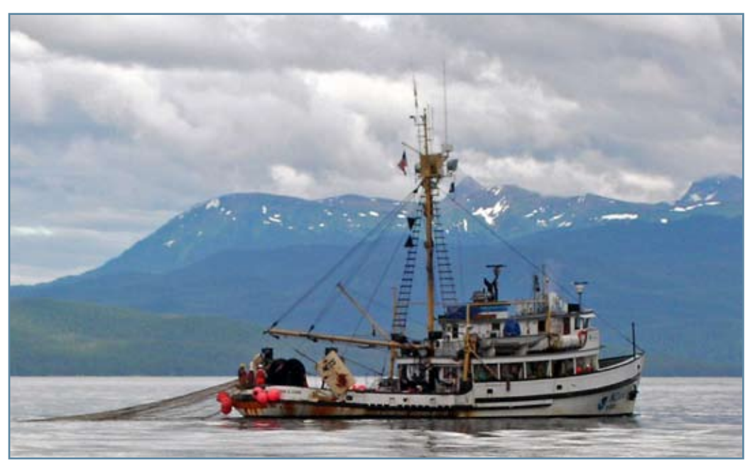
NOAA vessel J. N. Cobb trawling for epipelagic fishes in Icy Strait, 2005, with a 264 Nordic rope trawl.