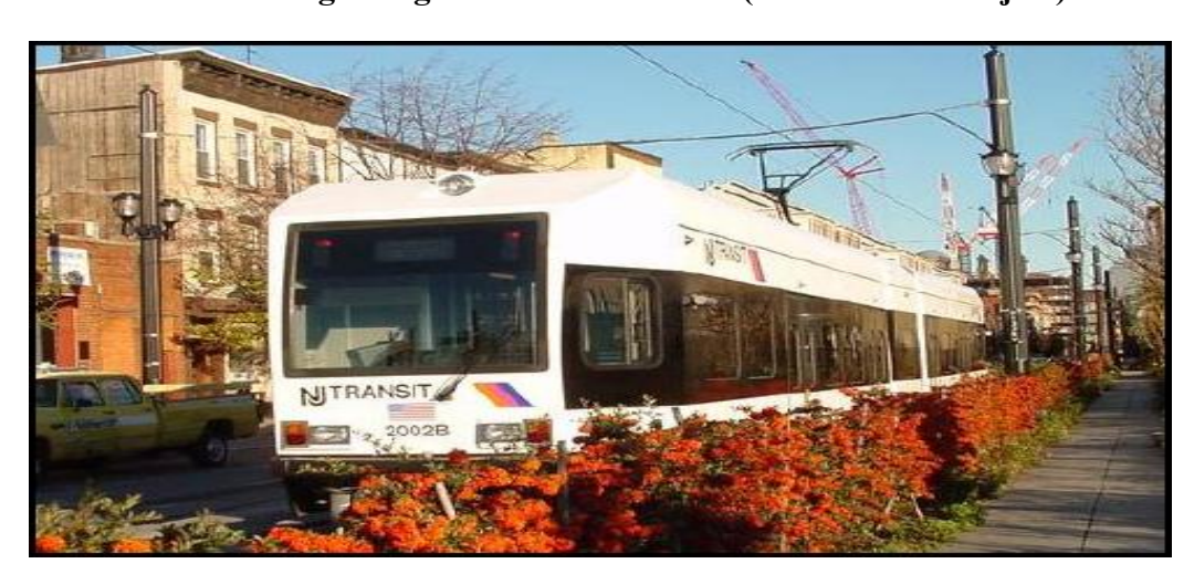
Hudson-Bergen Light Rail Transit Line (DBOM PPP Project)

Under a design-build-operate-maintain ("DBOM") or build-operate-transfer ("BOT") delivery approach, the selected contractor is responsible for the design, construction, operation, and maintenance of the facility for a specified time. The contractor must meet all agreed upon performance standards relating to physical condition, capacity, congestion, and/or ride quality. The potential advantages of the DBOM or BOT approach are the increased incentives for the delivery of a higher quality plan and project because the private partner is responsible for the performance of the facility and for maintaining the project, in its complete and fully operational state, for a specified period of time after construction. Since 2000, three transit projects in the U.S. have been procured as DBOMs: NJ Transit Hudson-Bergen LRT MOS-1 and MOS-2 (see illustration of Hudson-Bergen LRT Line below); and JFK Airtrain.