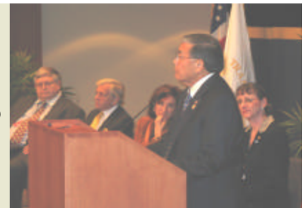
Transportation Secretary Norman Mineta speaks to the audience at the NTSB's 30-year celebration.

In the Independent Safety Board Act, Congress noted that a separate independent Safety Board was vital because the Board must make conclusions and recommendations critical of agencies and their officials.