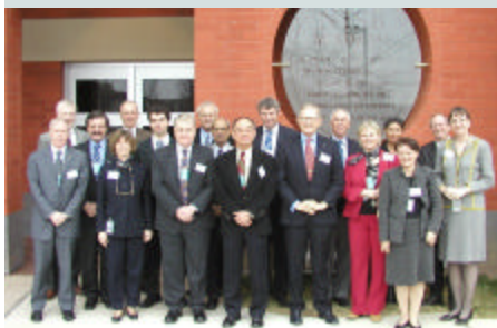
Members of International Transportation Safety Association during their visit to the NTSB Academy.

The 11th annual Chairman's meeting of the International Transportation Safety Association (ITSA) was held March 16 -18 in Washington, DC. ITSA is an association of independent organizations whose goal is "to improve transportation safety in each member country by learning from the experiences of others." ITSA members include representatives from Australia, Canada, the Commonwealth of Independent States, Finland, India, Holland, New Zealand, Sweden, Taiwan and the United States.