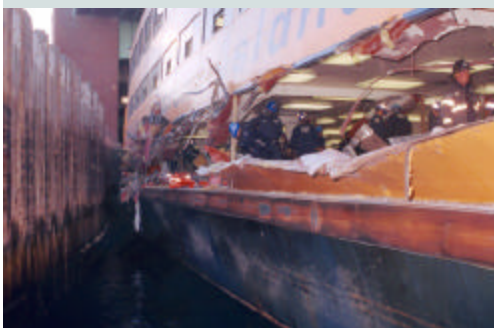
Damage to the ferry Andrew J. Barberi .