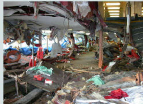
The interior of the Staten Island Ferry after colliding with a maintenance pier.

The Board made recommendations to the NYC DOT, U.S. Coast Guard, the states operating public ferries as well as the Passenger Vessel Association.