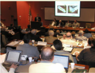
Some of the 160 participants at the PTC symposium.

The NTSB's Office of Railroad, Pipeline and Hazardous Materials Investigation, along with the NTSB Academy, sponsored a Positive Train Control (PTC) symposium at the NTSB Academy. The symposium was developed to encourage dialogue amongst suppliers, industry and government regarding issues surrounding automatic control systems to override mistakes made by human operators. Over 160 participants listened to presentations on status of test systems, operations efficiency, research and system development costs, operational and interoperability issues and alternative concepts. PTC has been on the NTSB Most Wanted list of safety improvements since the list was created in 1990.