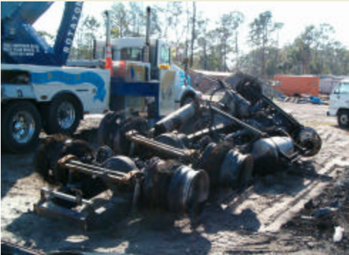
The remains of a gasoline tanker truck that crashed in Davie, FL.

The Office of Highway Safety (HS) launched to the crash of a tanker truck in Davie, FL on February 11th. The truck, loaded with 9,000 gallons of gasoline, overturned on an exit ramp transitioning from I-595 onto the Florida Turnpike. A 2001 Mercury Sable station wagon, which was pinned beneath the tanker during the accident, caught fire when gasoline from the truck ignited, killing the four occupants. The truck driver also received severe burn injuries in the crash.