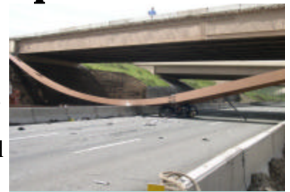
The girder collapse on I-70 in Golden, Colorado