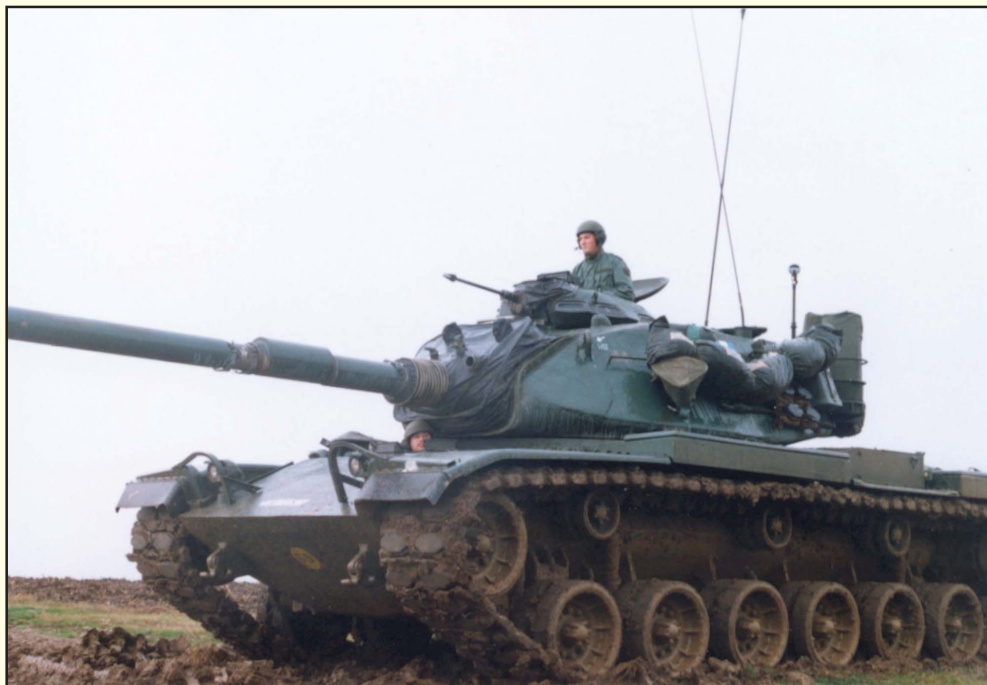
Afghan military forces will be provided with 13 M60A3 battle tanks in the next two months.

Greece has been participating in all United Nations mandated as well as in NATO operations and it has been part of ISAF from the beginning. Many Greek officers have been working in various ISAF Headquarters, while a Greek Engineer Battalion with 120 military personnel and 75 special vehicles has been contributing to the international effort by