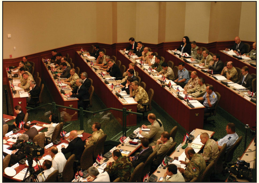
Military and civilian representatives of more than 50 countries, already contributing in Iraq, and other Coalition partners as well attended the ‘Partnership for Security and Prosperity in Iraq’ Conference.

The conference concluded with resolve to reinforce the partnership, extend security and achieve progress in building political and economic capacity both in Iraq and Afghanistan.