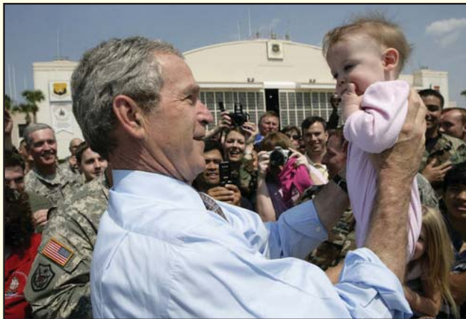
President George W. Bush greets the crowd on hand at MacDill Air Force Base in Tampa May 1. The president was on hand for a briefing at CENTCOM, and to deliver remarks to the CENTCOM Coalition Conference.