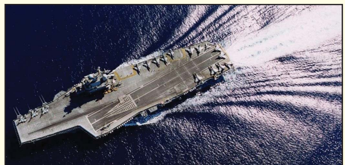
The nuclear aircraft carrier "Charles de Gaulle" speeds up in the Indian Ocean during Operation AGAPANTE 2006.

The French Task Force 150, under the command of Rear Adm. Alain Hinden, will take over the Task Force 473 soon.