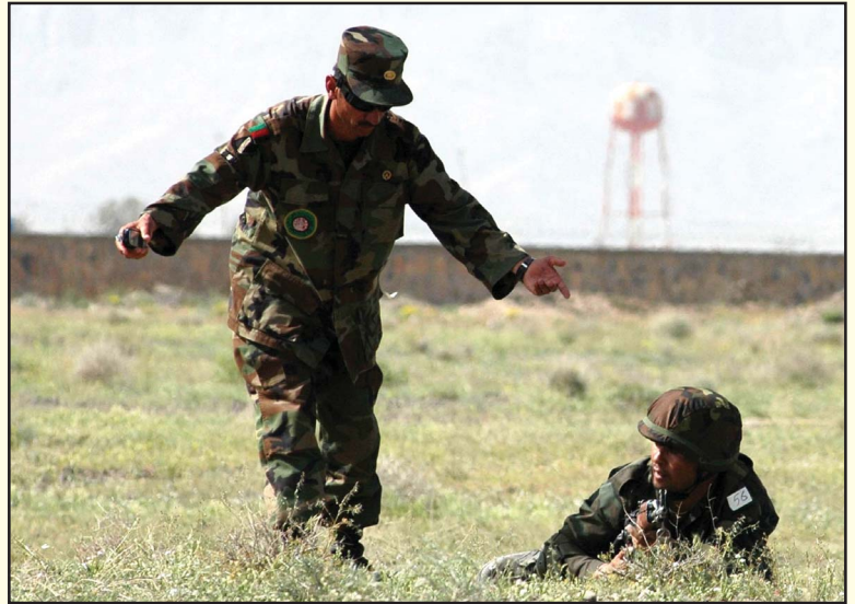
An Afghan National Army soldier receives corrective training from an instructor at the Team Leadership Course March 27 near Camp Shirzai. TLC is a requirement for soldiers in the ANA to become non-commissioned officers.

The commander also told the soon-to-be NCOs it is part of their duty to train soldiers using the knowledge they have acquired. "It