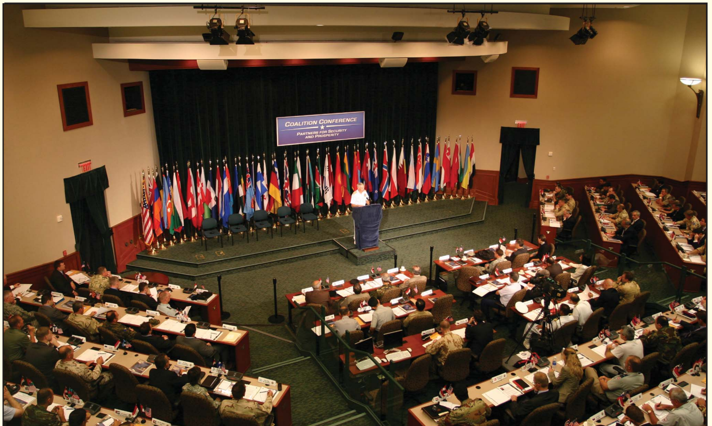
Adm. William J. Fallon, the commander of U.S. Central Command, addresses the audience at the CENTCOM Coalition Conference.