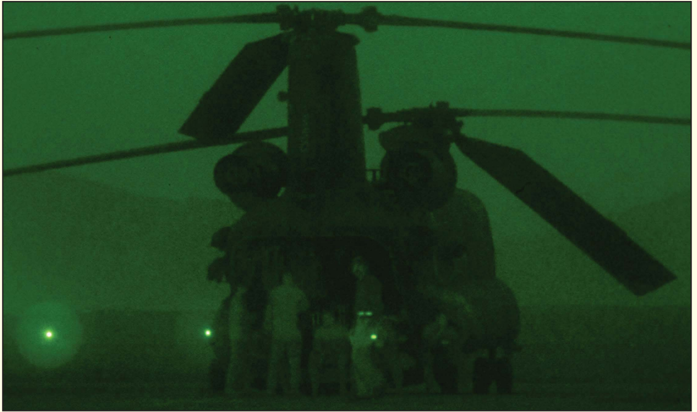
A Chinook helicopter sits on the tarmac.