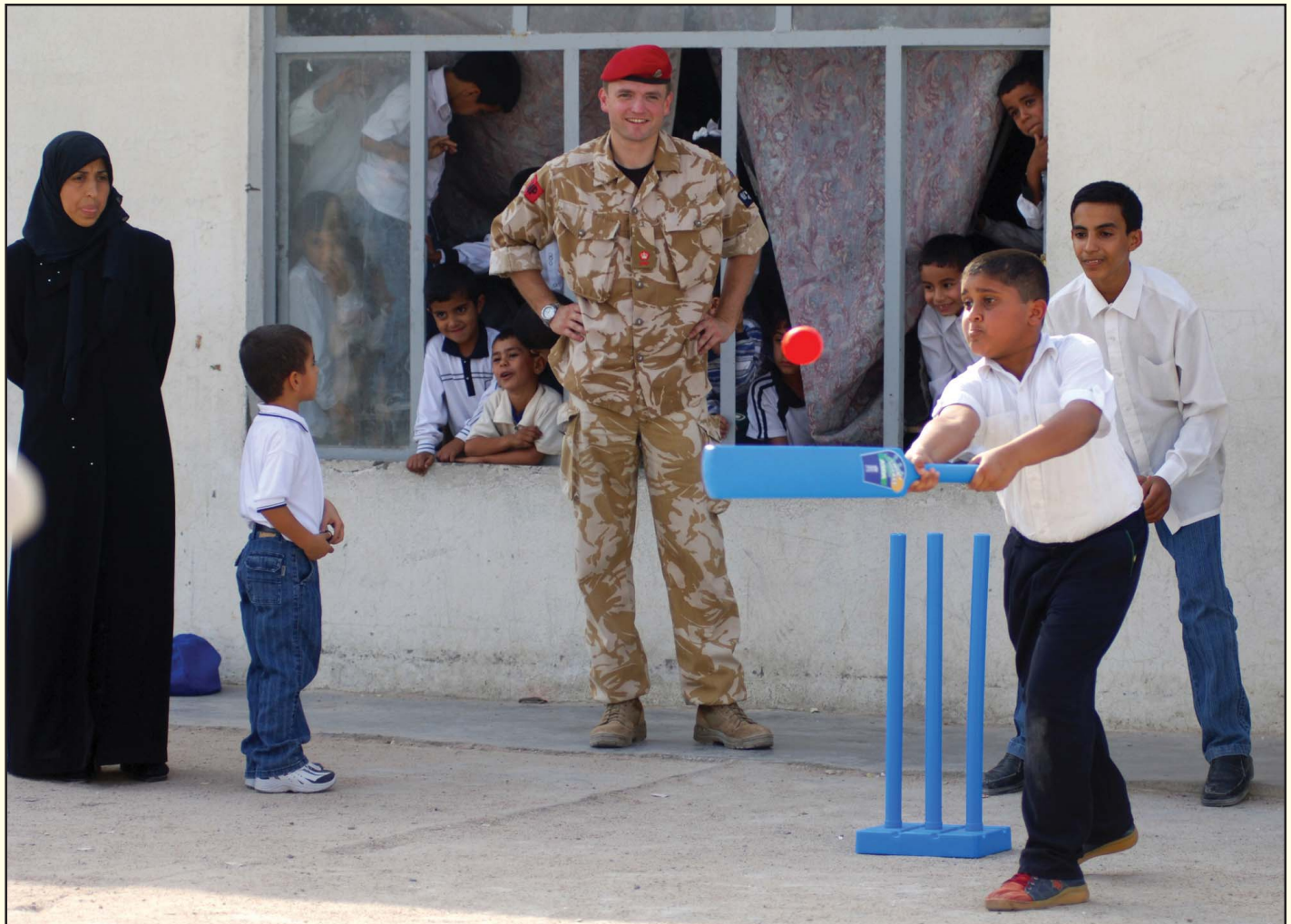
Iraqi children get to grips with 'Kwik Cricket.'

"Kwik Cricket was the natural choice for this project. It is cricket in its most basic form and so attractive to children. It's very easy to use and the simple kits of plastic bats and balls can be packed up quickly in case of emergency!"