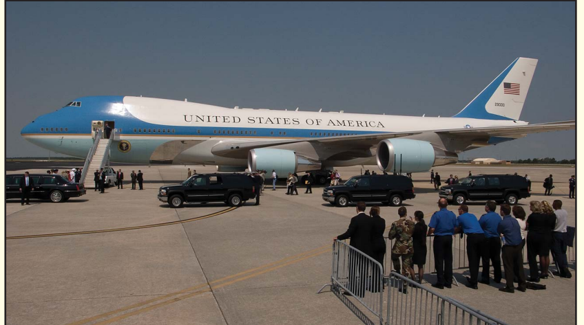
Air Force One arrives at MacDill Air Force Base in Tampa Fla. President George W. Bush came to MacDill to meet with Coalition and U.S. Central Comand leadership.