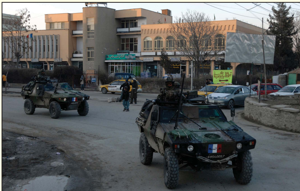
A French patrol in Kabul, Afghanistan.

In the spring of 2007, the Commando School will open in Kabul, led by American military personnel. Twenty French instructors will participate in order to organize five Afghan special forces battalions (500 men each) by September 2008.