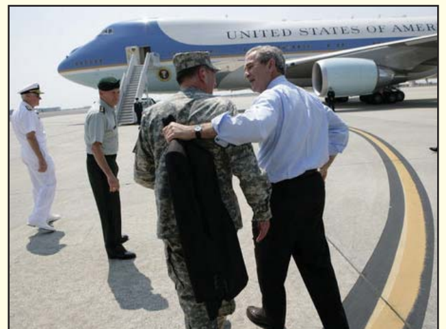
President George W. Bush walks with Gen. David Petraeus, commander of Multinational Force Iraq, as he prepares to board Air Force One May 1, after visiting CENTCOM at MacDill Air Force Base in Tampa, Fla.