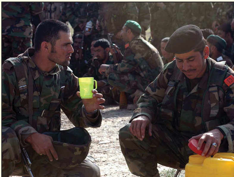
ANA soldiers drink water during the Team Leadership Course near Camp Shirzai March 26.

Colon-Rosa noted most courses start off with 120 - 130 students. Out of those, 25 - 30 students will graduate. Most are kicked out of the course because of discipline problems or for missing more than three days. "We started out with 93 students and kicked four out for discipline in the first two days," Colon-Rosa said.