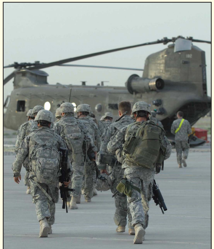
International Security Assistance Force soldiers walk toward a Chinook helicopter.

The operation, launched from Kandahar Airfield, was a coordinated multi-national effort including Chinook, Blackhawk and Apache helicopters. The ISAF troops conducted a night advance and secured predetermined objectives.