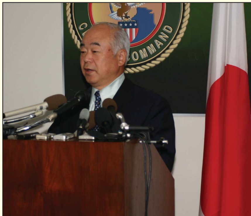
Japanese Minister of Defense Fumio Kyuma addresses members of the Japanese media at Coalition Village 3 April 30.

“The most important thing is to make the current (Iraqi) government more capable,” Harada said of Kyuma. “Crude oil is also an issue and is a top priority.”