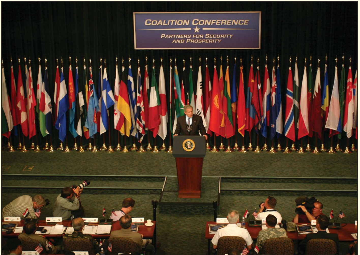
President George W. Bush delivers remarks May 1 to the CENTCOM Coalition Conference at MacDill Air Force Base in Tampa.