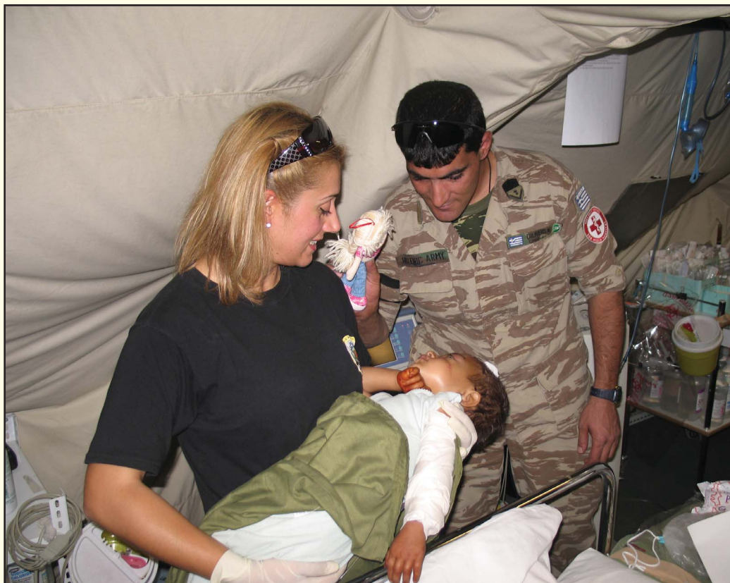
Since the establishment of the role-II military hospital by Greece, one and a half year ago in Kabul, almost 5,000 ISAF soldiers and Afghan civilians have received treatment here.

An additional amount of 15 million euros ($20 million) has been offered for the reconstruction program of Afghanistan, in the course of the next five years.