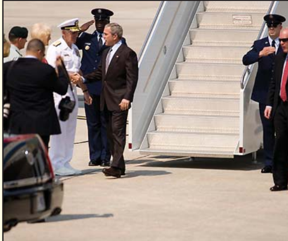
Adm. William J. Fallon, commander of U.S. Central Command, greets President George W. Bush upon his arrival at MacDill Air Force Base. This was Bush's first visit to MacDill and U.S. CENTCOM since Fallon took command of CENTCOM.