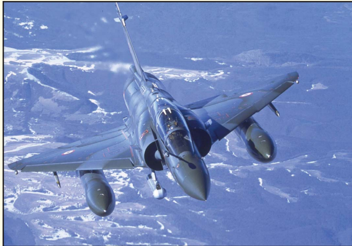
A Mirage 2000D in the Afghan sky.