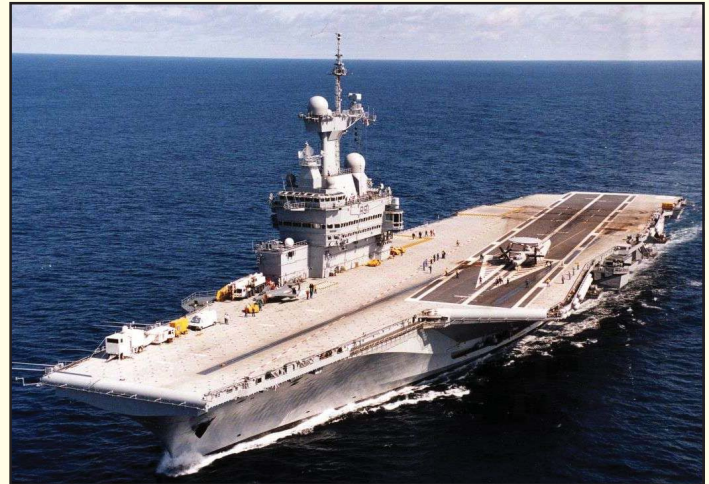
The nuclear aircraft carrier "Charles de Gaulle" in the North of the Indian Ocean.

To support the Coalition by contributing to operation OEF and ISAF, by significantly reinforcing military forces in the zone. This support aims to demonstrate France's will and determination to participate actively in this fight against international terrorism and to be ready to participate or to conduct any engagement at short notice. In order to achieve this it is necessary to maintain a high degree of coordination and interoperability with the friendly naval forces.