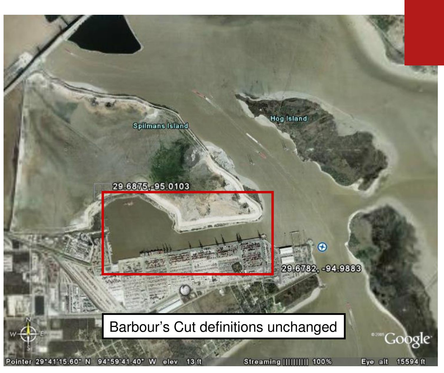
Barbour's cut: SE of 29.6875,-95.0103 and NW of 29.6872,-94.883