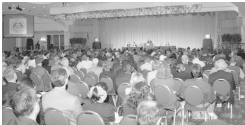
The Bureau of Industry and Security's two Update Conferences during Fiscal Year 2002 attracted over 1,000 exporters.

In addition to the regular seminar program, BIS conducts Chemical Weapons Convention (CWC) seminars. This industry-specific seminar program is specially tailored for companies subject to the reporting and on-site verifications requirements under the CWC Regulations. In Fiscal Year 2002, BIS conducted 37 such seminars in 16 states, which were attended by 2,273 participants.