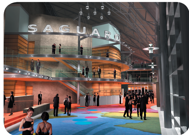
The volunteer program will be instrumental in assisting patrons at the new Tempe Center for the Arts.

The TCA volunteer program will be starting in 2006. Volunteers will receive mailings of the TCA program newsletter, a TCA gift shop discount and other TCA benefits.