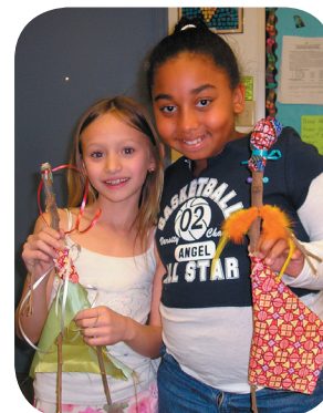
Meyer Elementary School students made ancestor dolls and learned about Yoruba beaded art and its importance to Black history through a grant awarded to the Bead Museum.

Additional programs receiving funding include a classroom symphony series, a young artists' piano festival and a program that provides preschoolers from low-income families with arts experiences to help them learn academic and life skills through music, movement and creative drama.