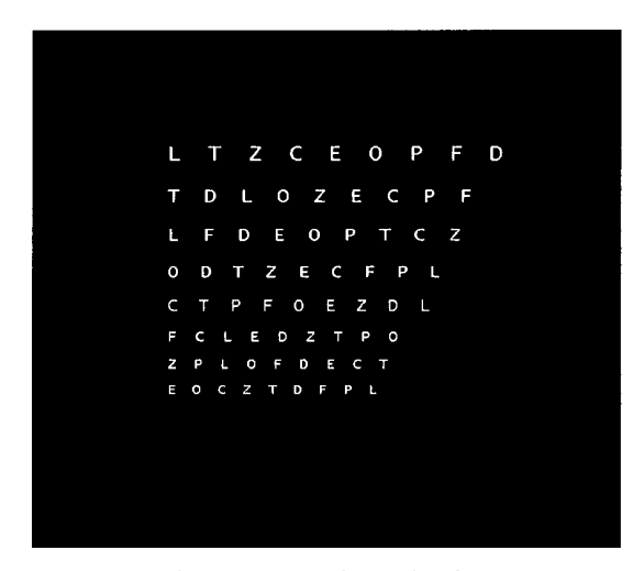
Figure 1. Eye chart stimulus

Stimuli: Figure 1 illustrates the eye chart used in the experiment. The eye chart consisted of eight rows of letters (Lucida Console font) with each row containing nine unique letters that are commonly used in the Snellen eye chart. Physical x and y pixel dimensions of each character box from lowest to highest rows were 8 by 10, 9 by 11, 10 by 12, 11 by 15, 12 by 16, 14 by 18, 15 by 19, and 16 by 22, respectively. Text color was red, green, yellow, white or black.