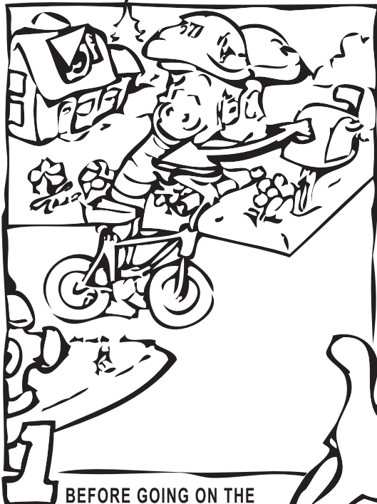
1 BEFORE GOING ON THE STREET FROM YOUR DRIVEWAY OR SIDEWALK, YOU SHOULD: