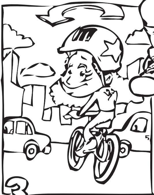
3 BEFORE SWERVING, TURNING OR CHANGING LANES, YOU SHOULD: