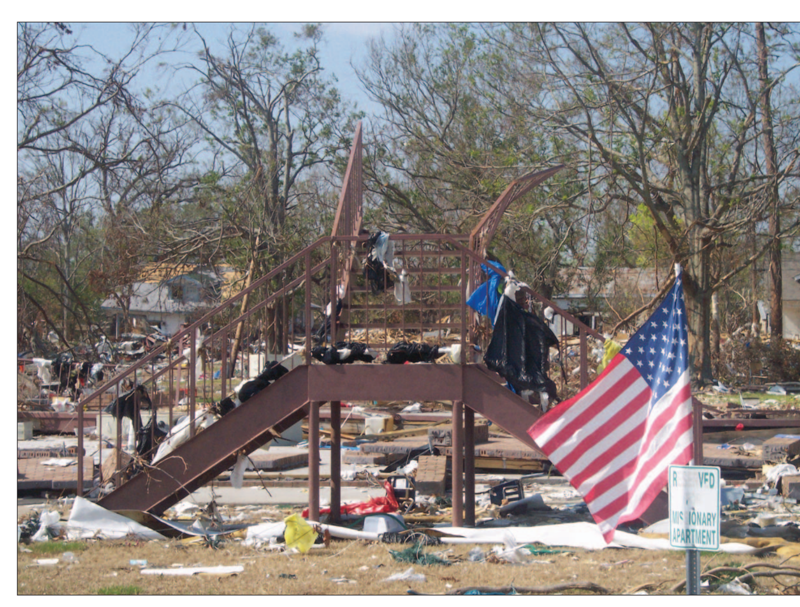
Ruins of apartment building, Long Beach, MS

Avoiding past mistakes will not suffice. Our leadership and systems must be prepared for catastrophes we know will be unlike Katrina, whether due to natural causes or terrorism. The Committee hopes to help meet that goal through the recommendations in this Report, because almost exactly four years after 9/11, Katrina showed that the nation is still unprepared.