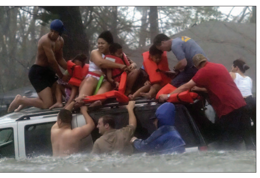
Trapped by floodwaters, New Orleans

• The City of New Orleans, with primary responsibility for evacuation of its citizens, had language in its plan stating the city's intent to assist those who needed transportation for pre-storm evacuation, but had no actual plan provisions to implement that intent. In late 2004 and 2005, city officials negotiated contracts with Amtrak, riverboat owners, and others to pre-arrange transpor-