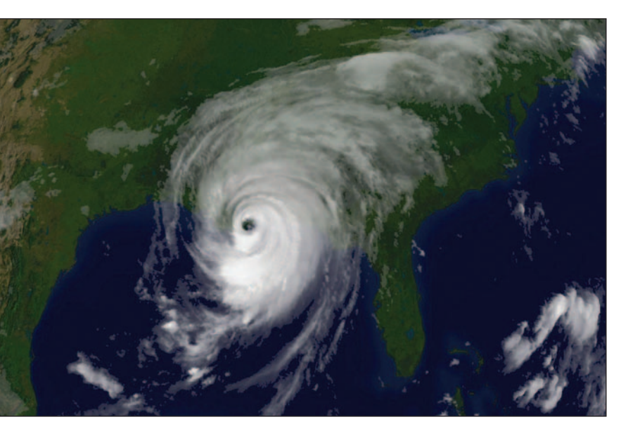
Hurricane Katrina over the Gulf Coast, August 2005

But the suffering that continued in the days and weeks after the storm passed did not happen in a vacuum; instead, it continued longer than it should have because of – and was in some cases exacerbated by – the failure of government at all levels to plan, prepare for, and and respond aggressively to the storm. These failures were not just conspicuous; they were pervasive. Among the many factors that contributed to these failures, the Committee found that there were four overarching ones: