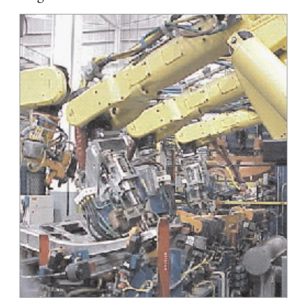
Figure 5. Robotic welders in a modern automotive assembly. Note the absence of sparks and intense UV radiation. Manufacturing engineers responsible for the robotic system operate in front of a control panel that is not in view.

Chemical manufacturing processes in the United States, Italy, and China, for example, range from manual reactor vessel charging, mixing, packaging, and maintenance to processes that are enclosed and automatic. The same process under these different conditions has different implications for worker safety and health. If a worker was exposed, the physiologic route of entry cannot always be anticipated, because knowledge of the physical state of the substances at different stages in the process is lacking.