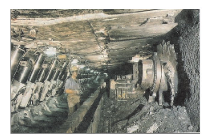
Figure 1. Improved productivity is realized with improvements in safety and health in longwall mining.