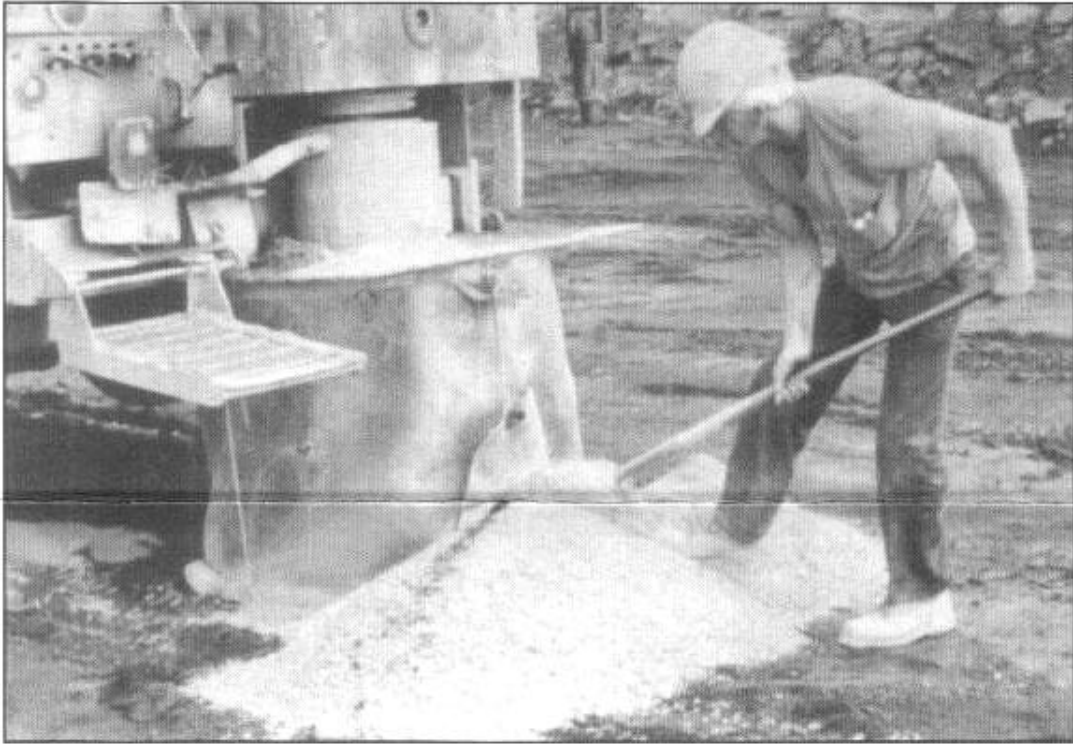
Figure 1. Dry dust collection system for blast hole drill: circular deck shroud.