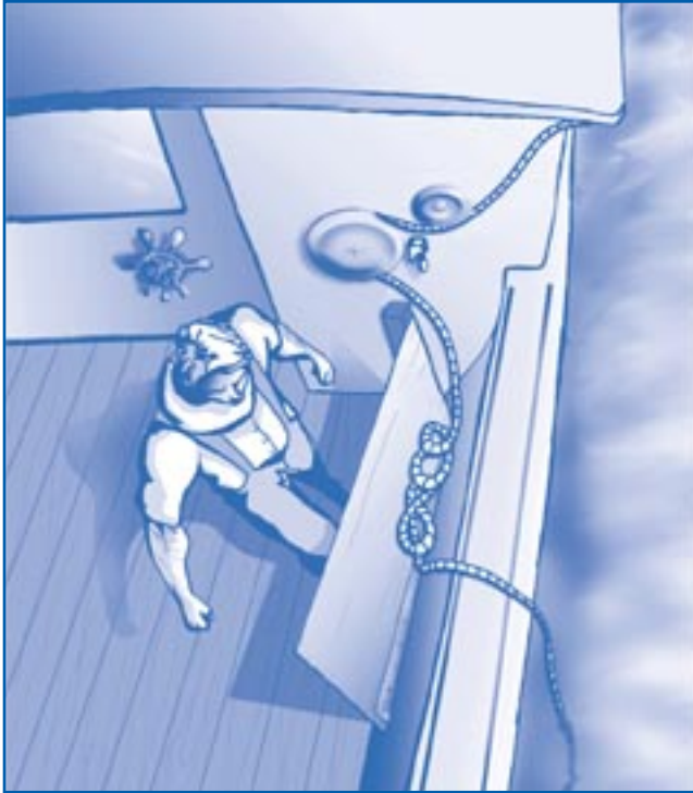
Figure 3. Line bin made of plywood with a piano hinge that allows it to drop open and accept trap rope from the pot hauler. Illustration by Media Stream.

and pass the line in front of the pole to lead the line out of the vessel (Figure 2).