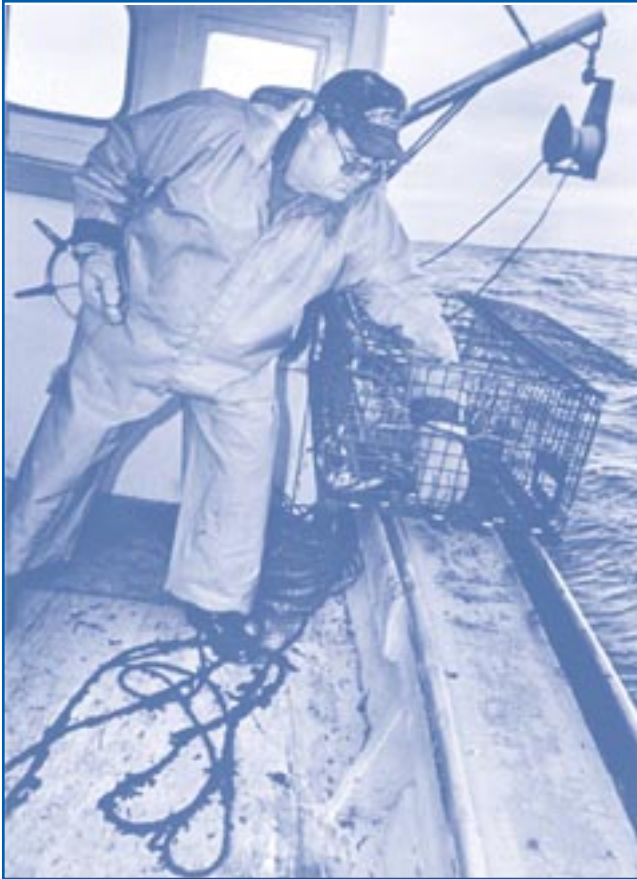
Figure 1. Lobsterman hauling a single lobster trap.

of Public Health and the National Institute for Occupational Safety and Health (NIOSH) recently surveyed lobstermen to