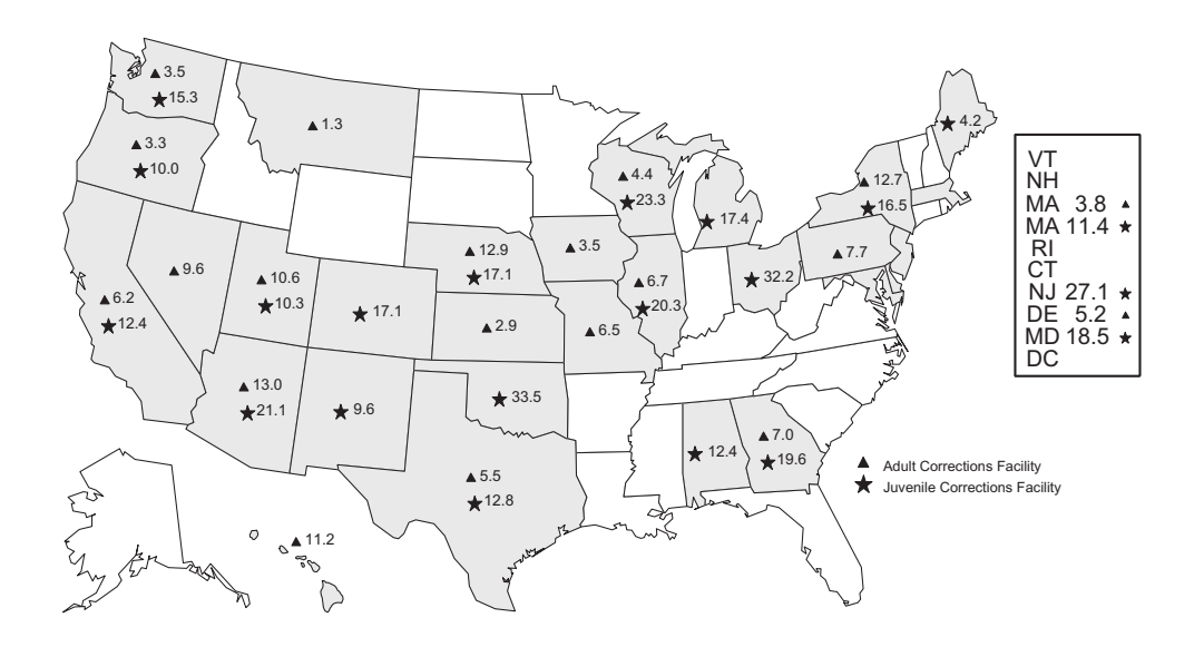
Figure JJ. Chlamydia — Positivity in women entering juvenile and adult corrections facilities, 2003

Note: The median positivity is presented from facilities reporting >100 test results. Arizona, California, Hawaii, Illinois, Massachusetts, Nevada, New York, Pennsylvania, Texas, Utah, and Wisconsin submitted data from more than one adult corrections facility. Alabama, Arizona, California, Illinois, Michigan, New York, Texas and Washington submitted data from more than one juvenile corrections facility.