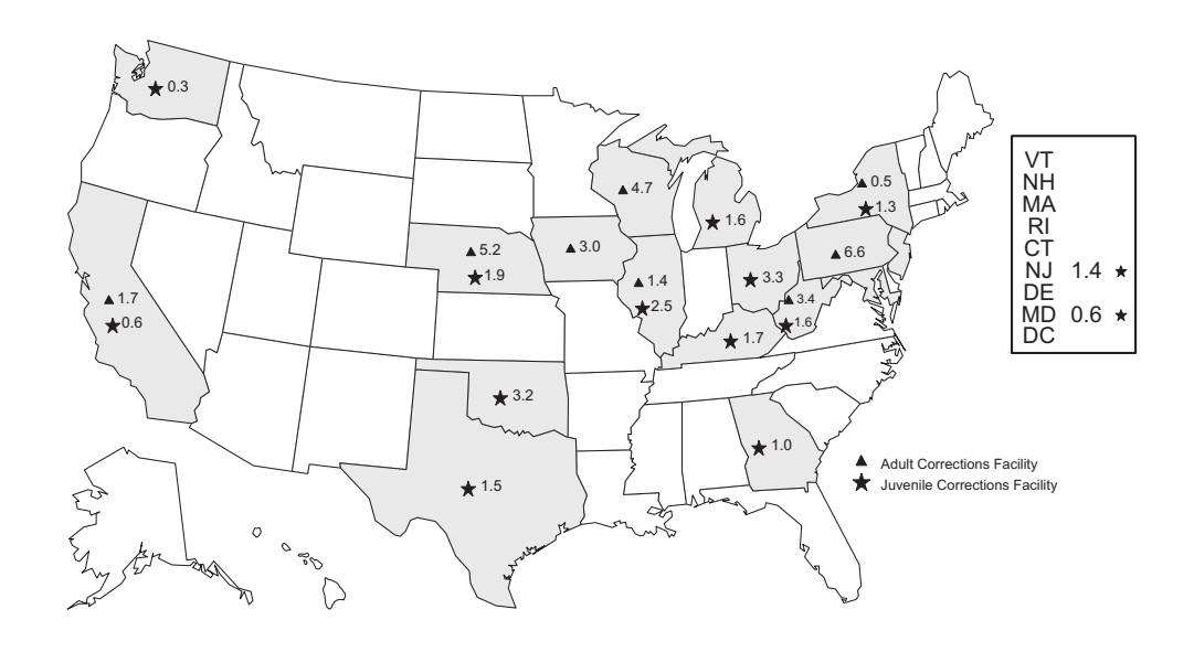
Figure MM. Gonorrhea — Positivity in men entering juvenile and adult corrections facilities, 2003

Note: The median positivity is presented from facilities reporting >100 test results. California, Nebraska, West Virginia, and Wisconsin submitted data from more than one adult corrections facility. California, Illinois, Kentucky, Maryland, Michigan, New Jersey, New York, and Washington submitted data from more than one juvenile corrections facility.