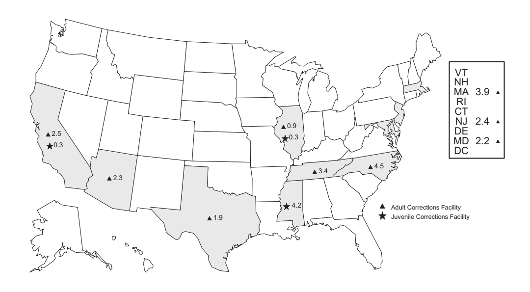
Figure OO. Syphilis serologic tests — Percent seroreactivity in men entering juvenile and adult corrections facilities, 2003

Note: The median positivity is presented from facilities reporting >100 test results. California and New Jersey submitted data from more than one adult corrections facility. California and Mississippi submitted data from more than one juvenile corrections facility.