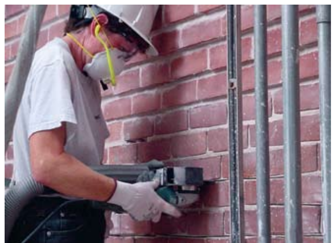
Figure 2. Keep the tool flat and positioned so that the dust from grinding is blown into the exhaust hose.