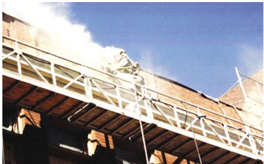
Figure 1. Uncontrolled mortar removal generating hazardous exposure to dust.

NIOSH has identified control measures to reduce worker exposure to hazardous dust during tuckpointing. Studies [Heitbrink and Collingwood 2005; Collingwood and Heitbrink 2007] show how an industrial vacuum