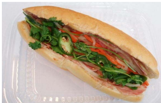
New ethnic foods coming to Seattle Public Schools.

These foods are taste tested and other considerations are made including cost, distribution and availability of foods.