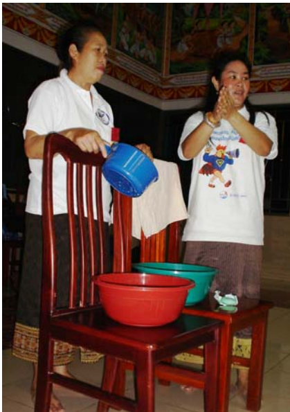
USAID supports community behavior change programs in Laos that teach methods to prevent the spread of avian influenza.